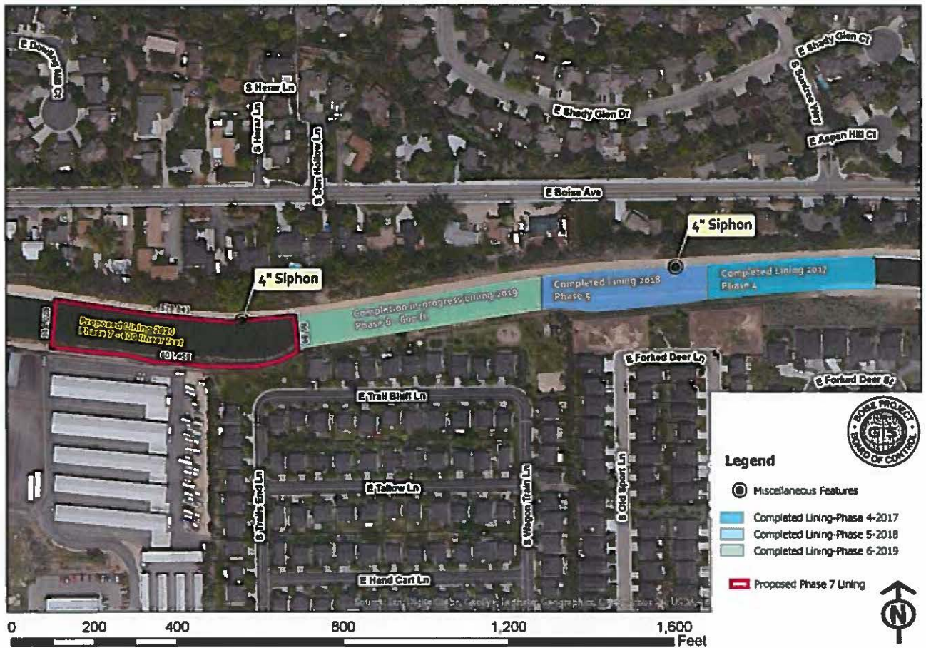
Figure 2 – Map of Proposed Project