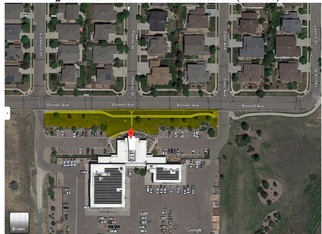
Figure 2 - Lawrence A. Wurl Service Center (LAWSC)

The project location address is 150 Lambert Avenue Erie, Colorado 80516. The project latitude is 39° 53' 37.6002" N and longitude is 104° 59' 51.3954" W. The proposed turf replacement will take place at the LAWSC building within the boundaries highlighted yellow in Figure 2 below.