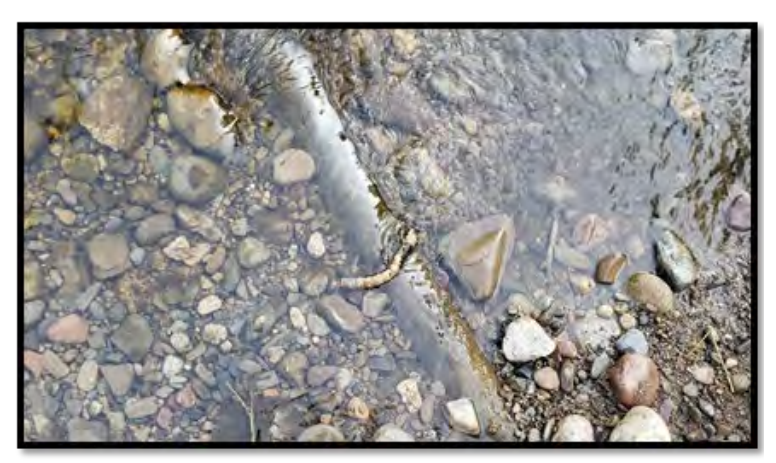
Figure 5. Exposed utility pipes running across the streambed of Warm Springs Creek.

Presumably associated with the irrigation diversion, and in the immediate vicinity of the diversion, are two pipes (possibly conduit) crossing Warm Springs Creek, both exposed in the bed (Figure 5). The design team is engaging with local utility companies and the City of Ketchum to determine the use of these pipes, if they are active, and potential appropriate replacements.