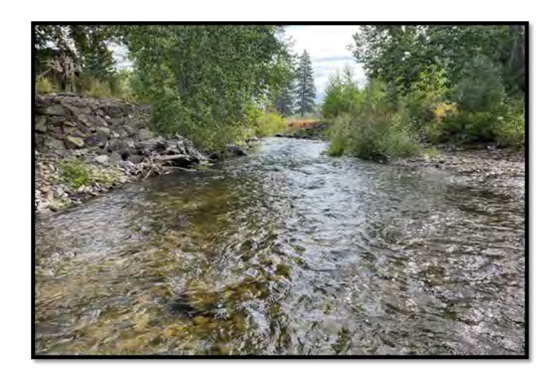
Figure 4. Image depicting armored banks of Warm Springs Creek, adjacent to the Warm Springs Preserve.

human infrastructure such as bridge abutments. Fine sediment introduced to the system tends to fill interstitial spaces between the armor causing severe embedment, further reducing pool formation and spawning habitat quality. The project reach has an average bed slope of 0.83% with sub-reaches that vary from 0.4% to a constructed boulder riffle at 6.4%. Most of the Warm Springs Creek banks within the project area are stable; many are also armored with riprap (Figure 4). Bank erosion is only prevalent where there is a lack of bank material stability including tree roots and riprap.