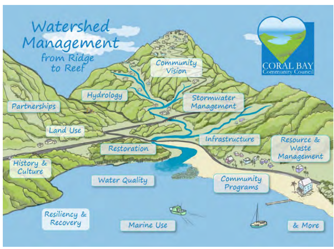
Figure 3. Elements and activities of the Ridge to Reef watershed management approach. This conceptual diagram also depicts water increasing in volume, strength, and velocity as it flows downstream/downhill and the