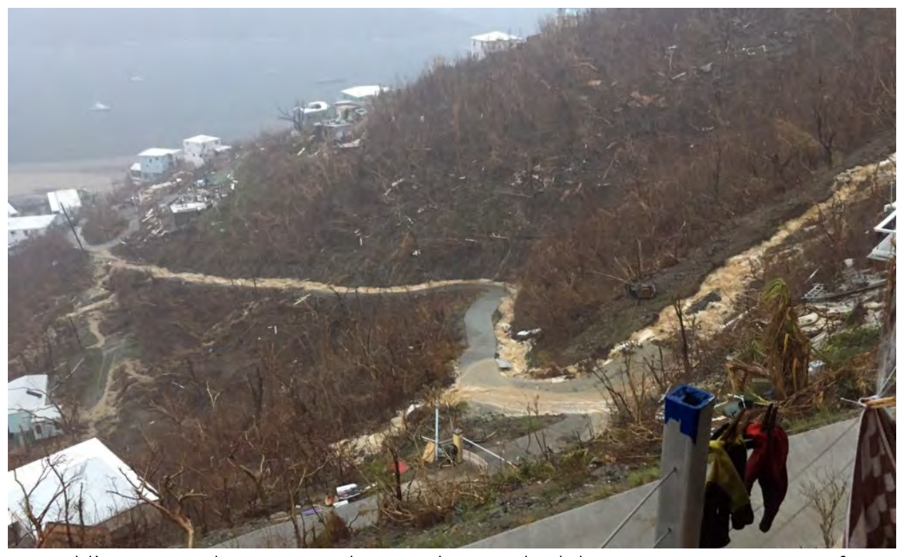
Harold's Way road, Lower Bordeaux Subwatershed during a 2017 rain event four days after Hurricane Maria