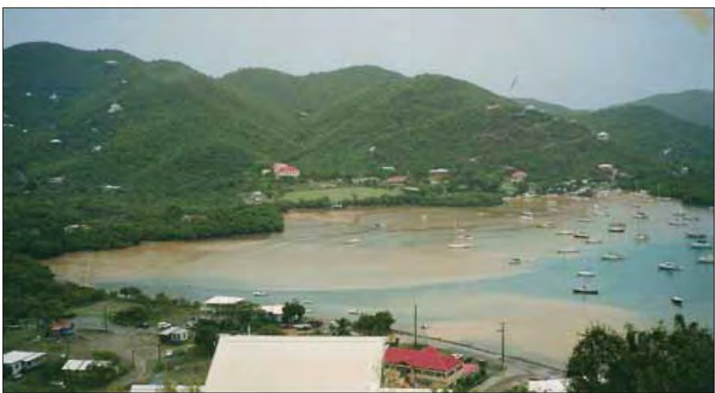
Figure 4: Photos of sediment-laden runoff entering the Bay and threatening water quality, habitat, and recreational use.

Additional environmental and flooding threats include uncontrolled development, damage from feral goats, donkeys, and pigs and invasive plant species (Reed 2015). Nine terrestrial wildlife species on the island are federally designated as threatened or endangered. Marine studies reveal the presence of 30 distinct coral species and 194 species of fish. The Bay and its surrounding waters host humpback whales, sea turtles, manatees, and dolphins and the federally endangered or threatened leatherback turtle, hawksbill, green turtle, and loggerhead turtle. High quality habitat for nesting and foraging is critical to provide much needed spaces for these species.