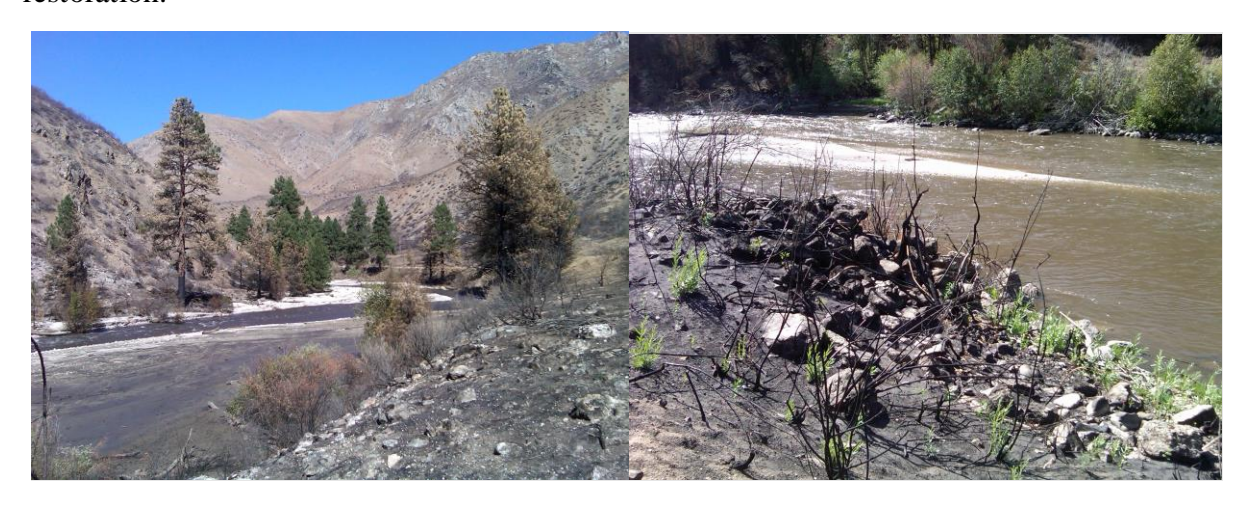
Aftermath of Elk Complex Fire (2013)

The watershed has also been subject to wildfire, most recently in 2013, with two large wildfires that affected vegetation conditions. Some habitat rehabilitation has occurred along the river shortly after the 2013 fire, but no major restoration work happened in later years. A watershed management group could help identify key areas in need of aquatic, riparian, and habitat restoration.