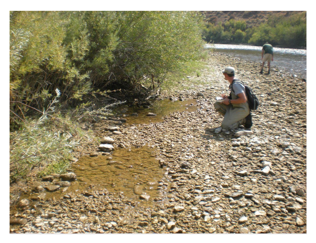
Collecting Data for Stranding Study (2012)

Water supply issues and pending proposals affecting the area include the proposed raise of Anderson Ranch Dam, pump storage and diversions or withdrawals from Anderson Ranch Reservoir by Elmore County, as well as by Cat Creek Energy. Each proposal separately or in combination can affect flow management in the SFBR downstream of Anderson Ranch Dam and will also affect the Reservoir elevations. A forum and process similar to the one for the Henry's Fork mentioned above could also improve opportunities for dialogue about the potential downstream implications of these pending proposals — with knowledge that the decisions about such proposals will unfold from other processes already underway.