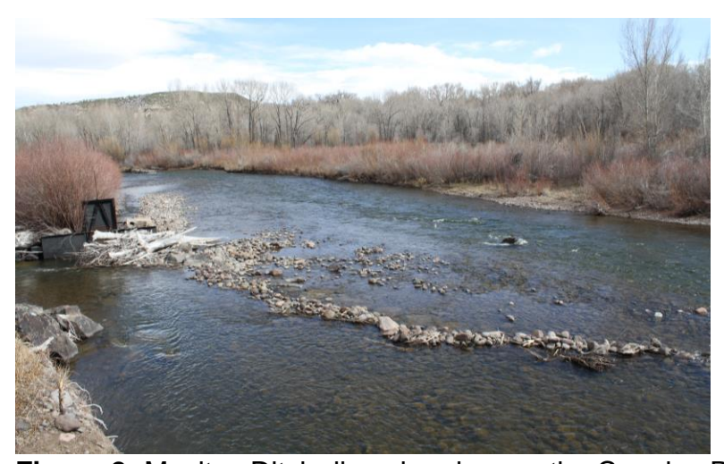
Figure 2: Mecitos Ditch diversion dam on the Conejos River.

The Mecitos Ditch is unable to divert its decreed water right during low streamflow conditions due to inadequate head pressure created by the diversion dam (see Figure 2, below). This results in less water available to irrigators, especially during the late summer when crop irrigation water requirement is relatively high. There is a sluice gate adjacent to the point of diversion, which is intended to transport sediment and debris downstream. However, it does not function effectively due to the orientation of the diversion dam, causing a disruption in the river's natural sediment transport regime and woody debris accumulation in the Mecitos Ditch feeder channel. Additionally, accelerated bank erosion and upstream of the diversion results in sediment accumulation in the ditch and degrades downstream aquatic habitat.