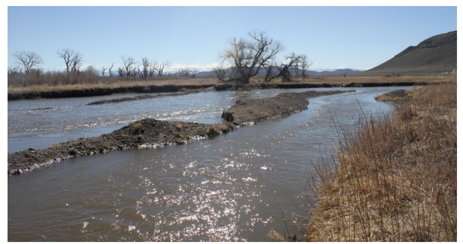
Figure 5: Poorly functioning diversion dam for the William Stewart Co. Irrigation Ditch.

No formal diversion dam exists for the ditch. Instead, river sediment consisting of sand and small cobbles is built up during the irrigation season to create adequate head pressure for the ditch. This presents a significant maintenance requirement for water users and negatively impacts aquatic habitat and water quality. Figure 5 shows the diversion dam in summer 2019 and illustrates these issues.