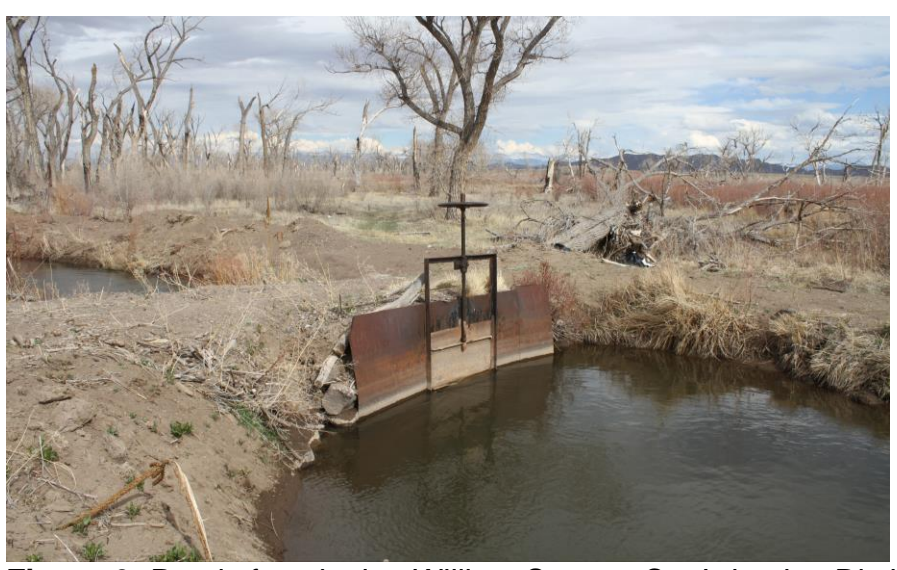
Figure 6: Poorly functioning William Stewart Co. Irrigation Ditch headgate.