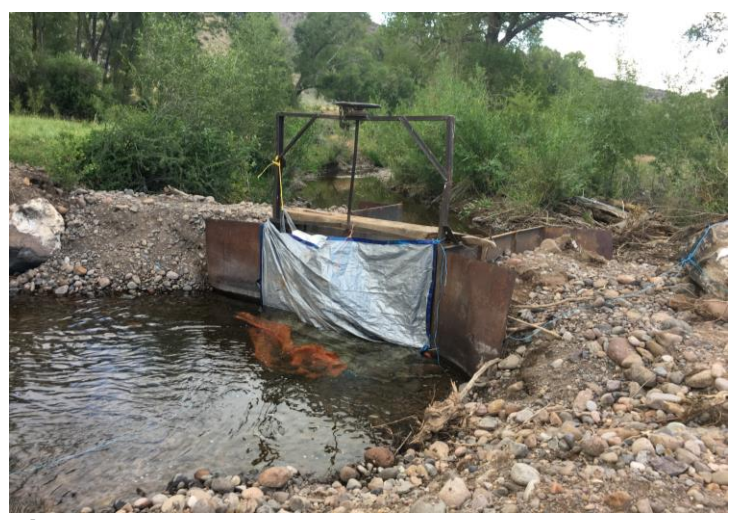
Figure 3: Erosion adjacent to the Mecitos Ditch headgate with temporary tarp installed to prevent leakage.

The Mecitos Ditch headgate was damaged during a flooding event in spring 2019 (see Figure 3). Water users are unable to fully close the headgate, resulting in leakage and increased maintenance needs. This also negatively impacts overall Conejos River water administration.