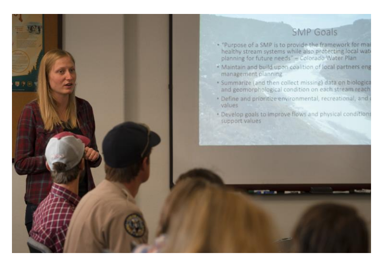
Figure 7: Stream Management Plan stakeholder meeting.

The Conejos River SMP addresses a variety of watershed management issues. To document current river health conditions, a river health assessment was conducted. As part of the assessment, the following river health indicators and metrics were considered: