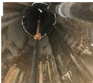
Image showing the physical dryness of the walls.