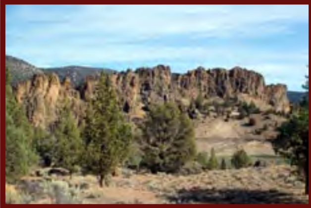
High basalt cliffs near Prineville, Oregon

Over the last 70 million years, the Cascade Range volcanoes have drastically changed the Central Oregon climate. Lava floods and ash plumes transformed what was a tropical sea into a high basalt plateau. About 15 million years ago, the volcanoes had grown high enough to block moisture from the Pacific Ocean, and a desert was born. The Crooked River, fed by warm springs in the Ochoco Mountains, slowly carved its way through the rugged desert.