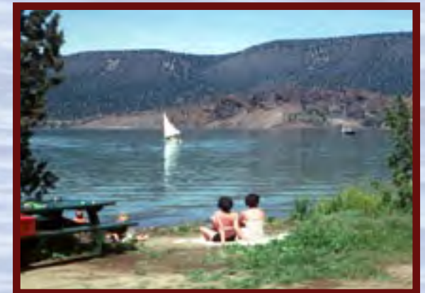
Prineville Reservoir: recreation since 1961

Prineville Reservoir immediately became a favorite destination. A state park, a wilderness area, and a national Wild and Scenic River adjoin the reservoir. The parks offer camping, swimming, picnicking, fishing, and boat launching facilities. Waterskiing is extremely popular at Prineville. A private concessionaire offers lodging and dining for recreationists at Prineville Reservoir Resort.