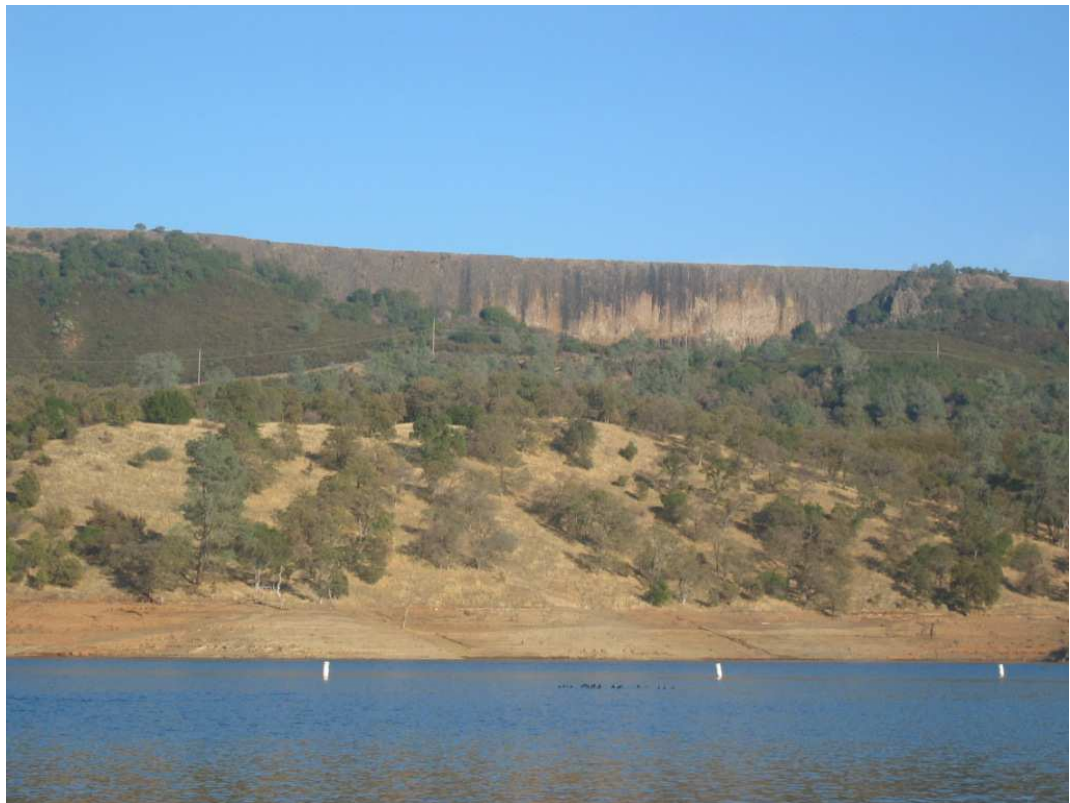
Photograph 4. View of Table Mountain from the lake.