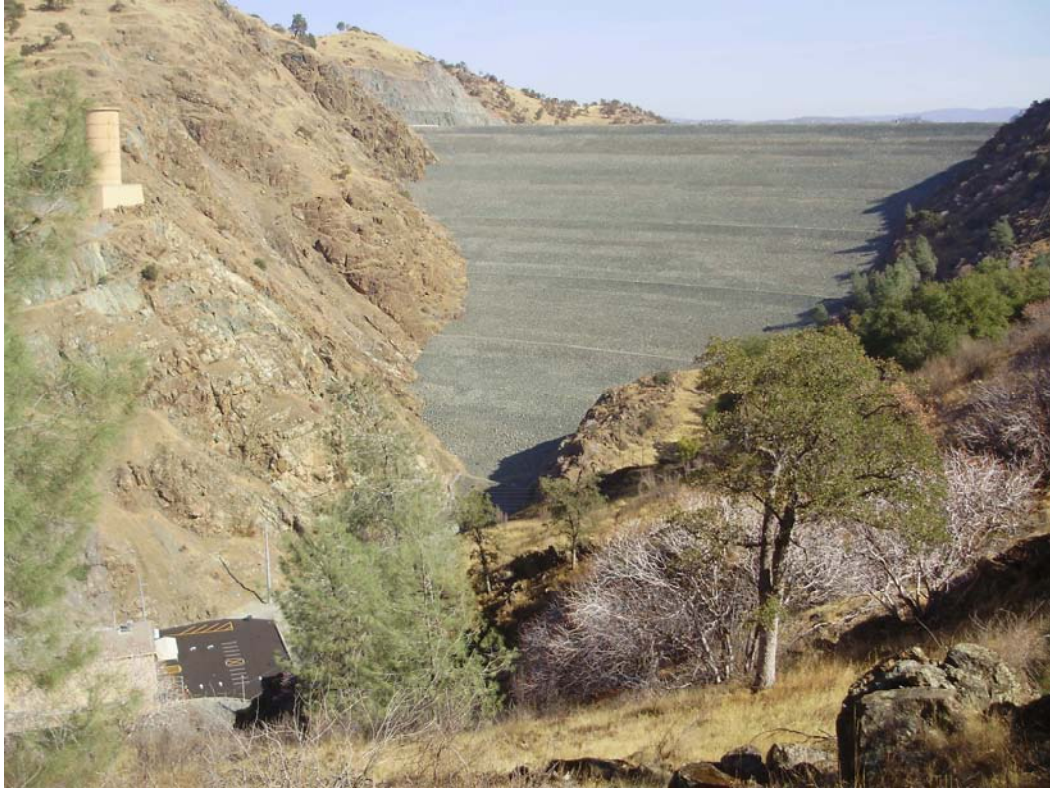
Photograph 13. View of the New Melones Dam.