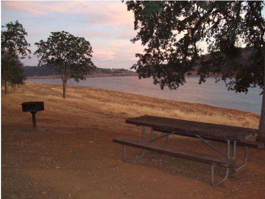
Photograph 16. Day Use Area.