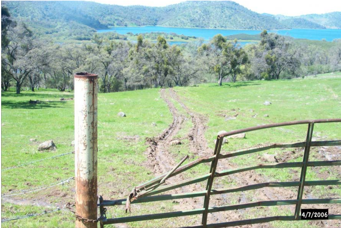
Photograph 25. Evidence of trespassing and vandalism damage at Shell Road.