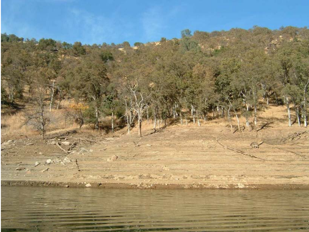
Photograph 17. Water scars along shoreline of New Melones Lake.