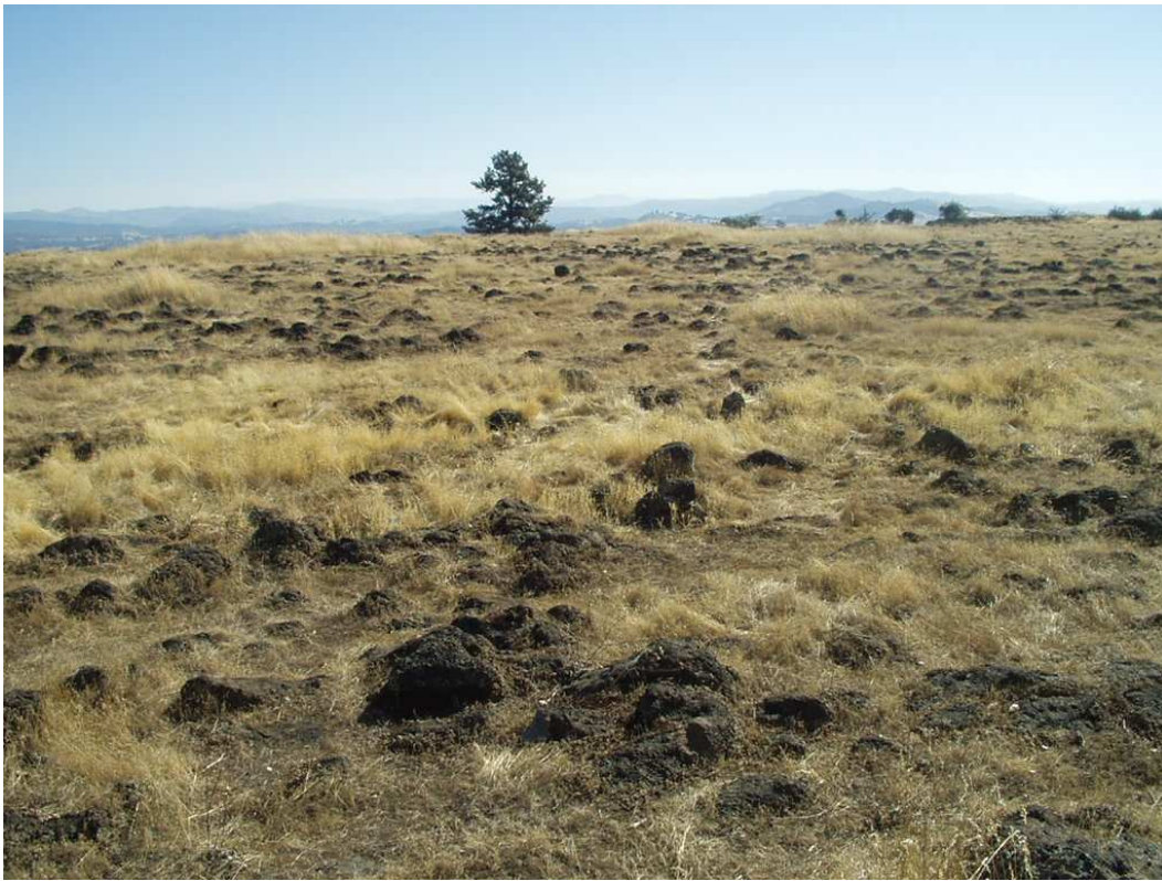
Photograph 8. View to the southeast on top of Table Mountain.