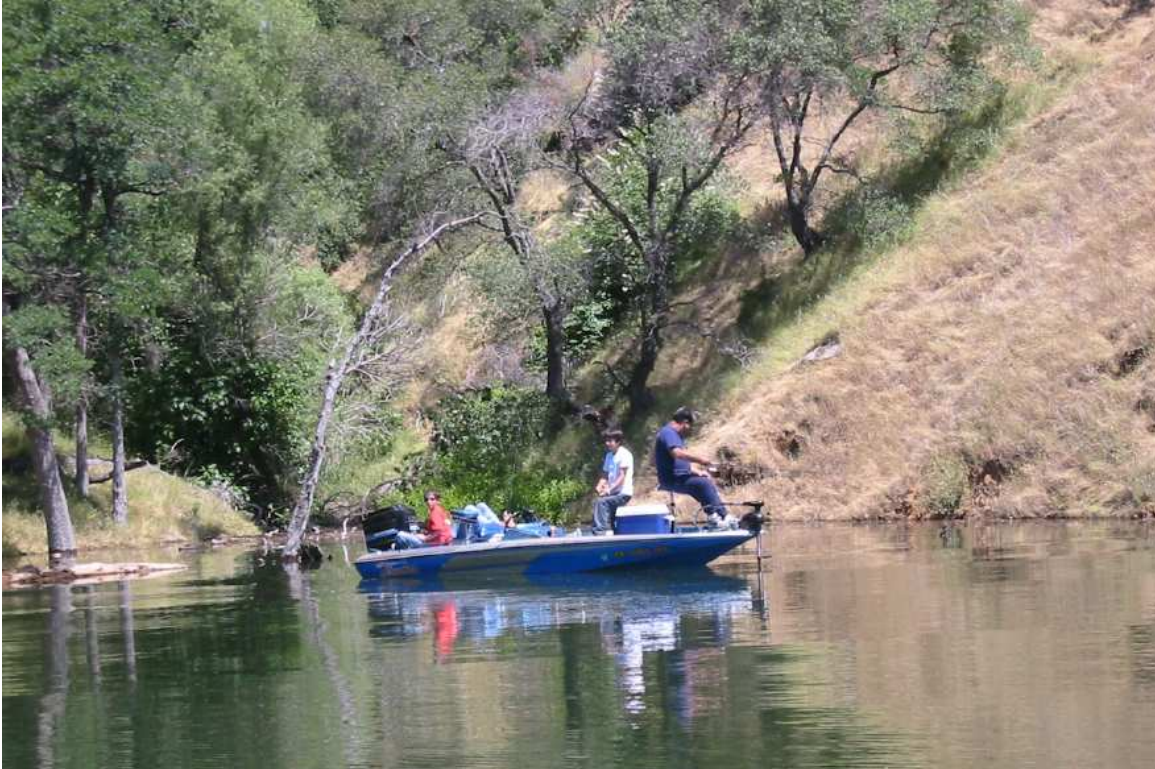
Photograph 21. Bass Fishermen