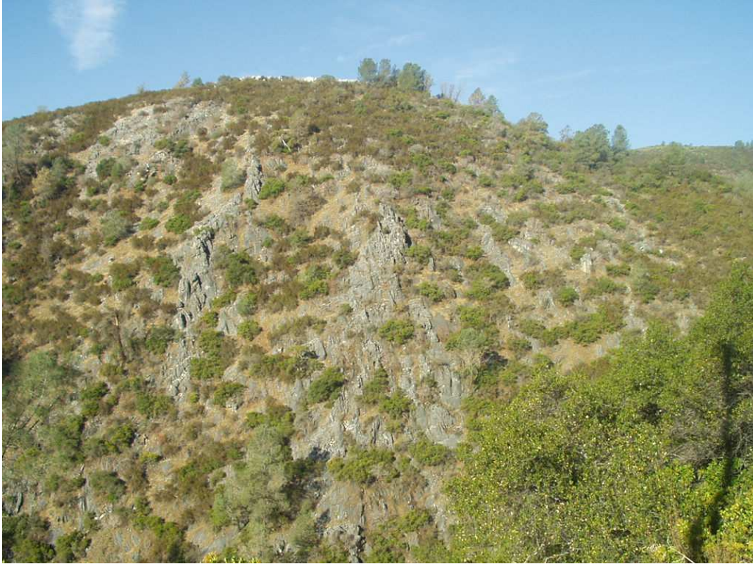
Photograph 3. Limestone formation in the North Fork of the Stanislaus River (primary location of caves).