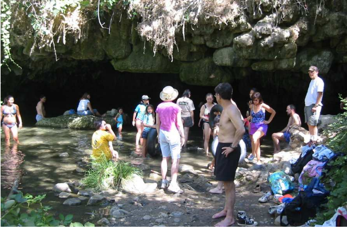
Photograph 23. Crowded conditions at Natural Bridges.