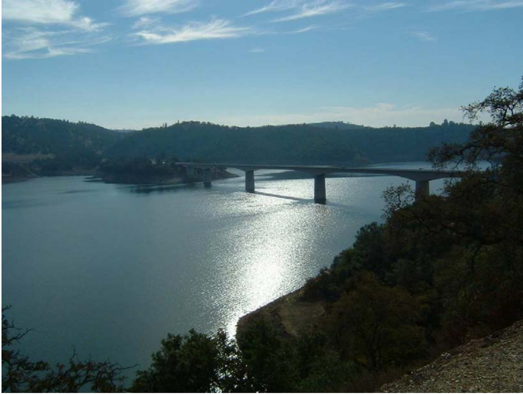
Photograph 9. View from Highway 49 Vista Point of the Highway 49 bridge and New Melones Lake.