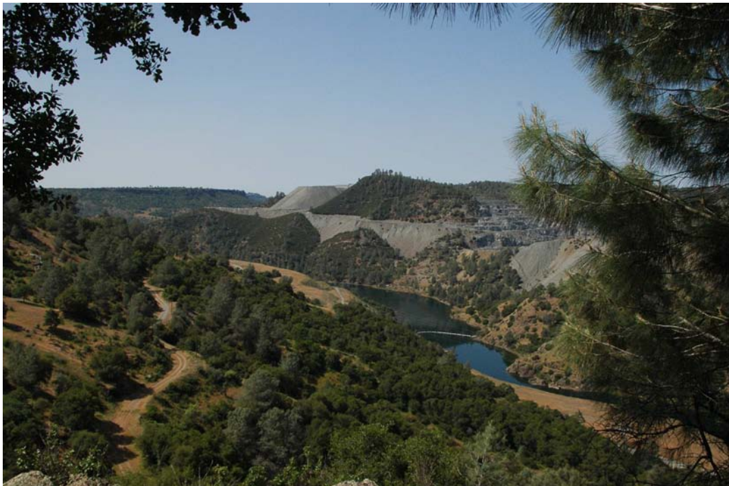
Photograph 20. Mined hillsides along the North Fork of the Stanislaus River.