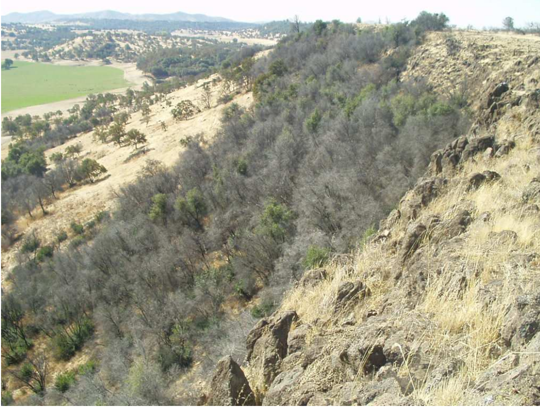
Photograph 7. Southeast slope of Table Mountain.