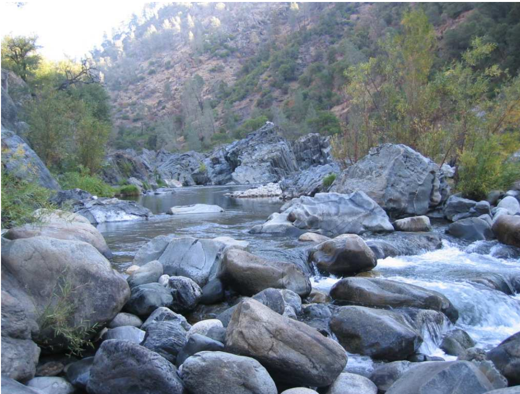
Photograph 10. Upper Stanislaus River and riparian vegetation-Clark Flat Planning Area.