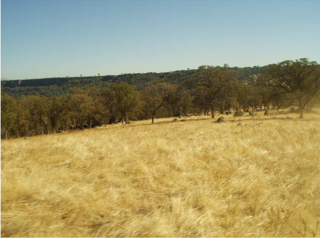
Photograph 5. Annual grassland and oak woodland in the Peoria Wildlife Management Area.