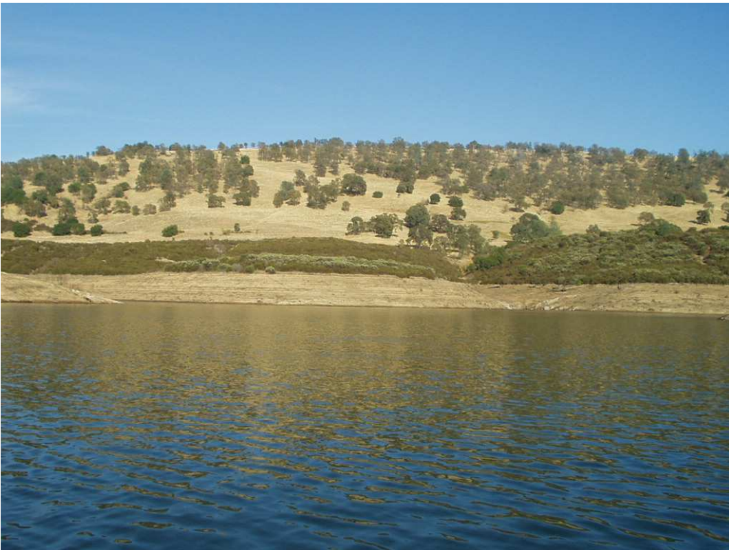
Photograph 6. Oak woodland and chaparral.