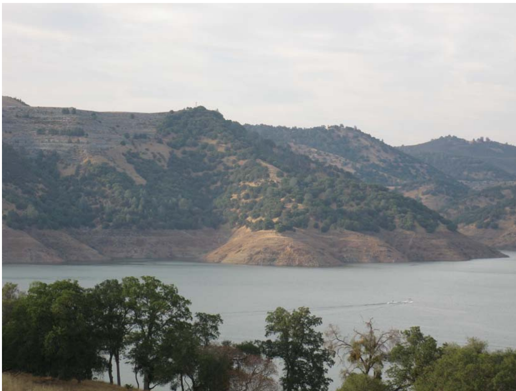
Photograph 14. View of Carson Hill Mine from the New Melones Visitor Center.