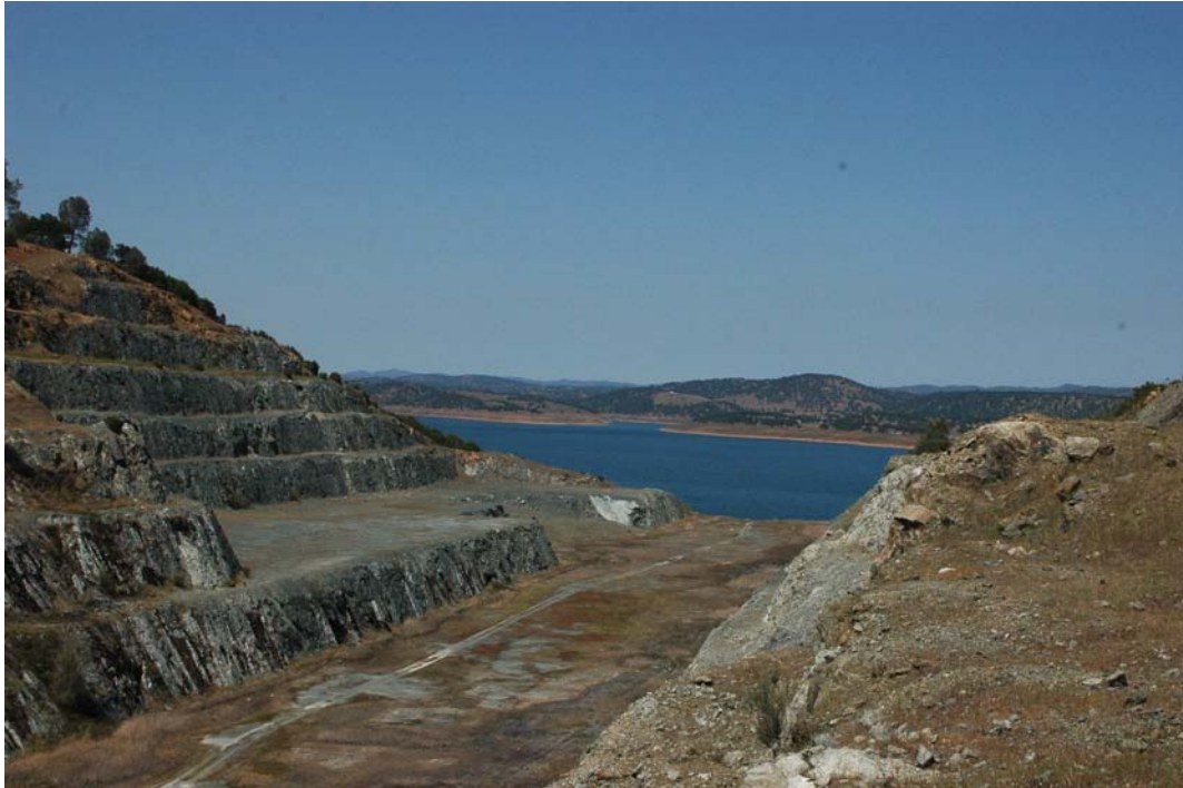
Photograph 19. New Melones Dam Spillway.