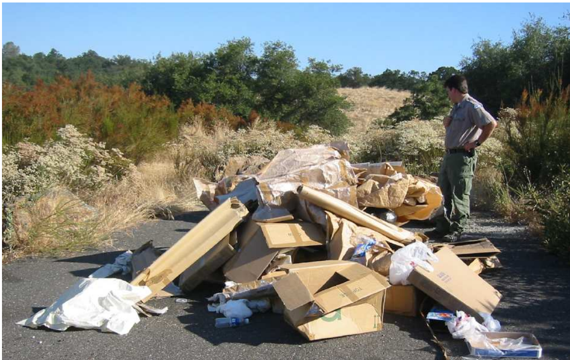
Photograph 26. Illegal dumping.