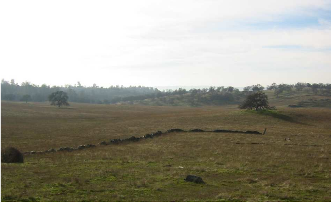
Photograph 27. Annual Grasslands and Oak Woodland, Bowie Flat.