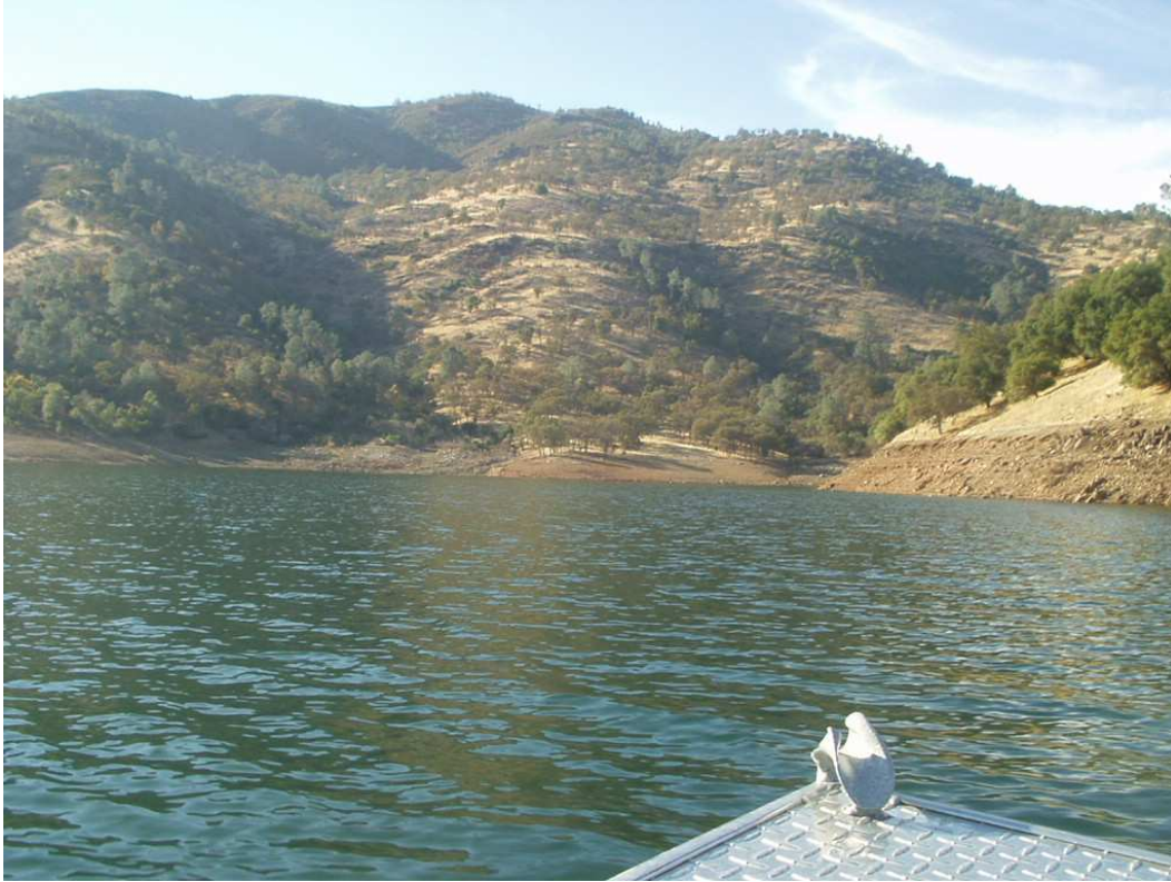
Photograph 1. Oak woodland within the Texas Charlie Planning Area and Bear Mountain in the background.