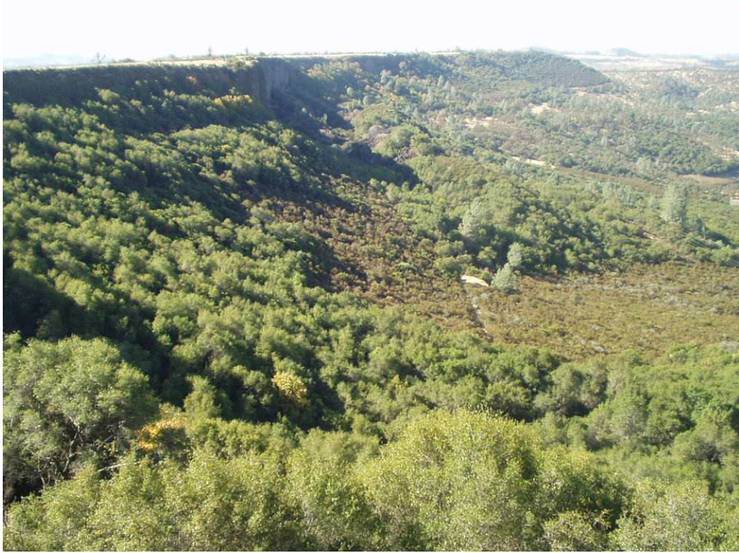
Photograph 15. View of the western side of Table Mountain.