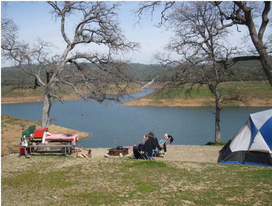
Photograph 22. Tent Camping