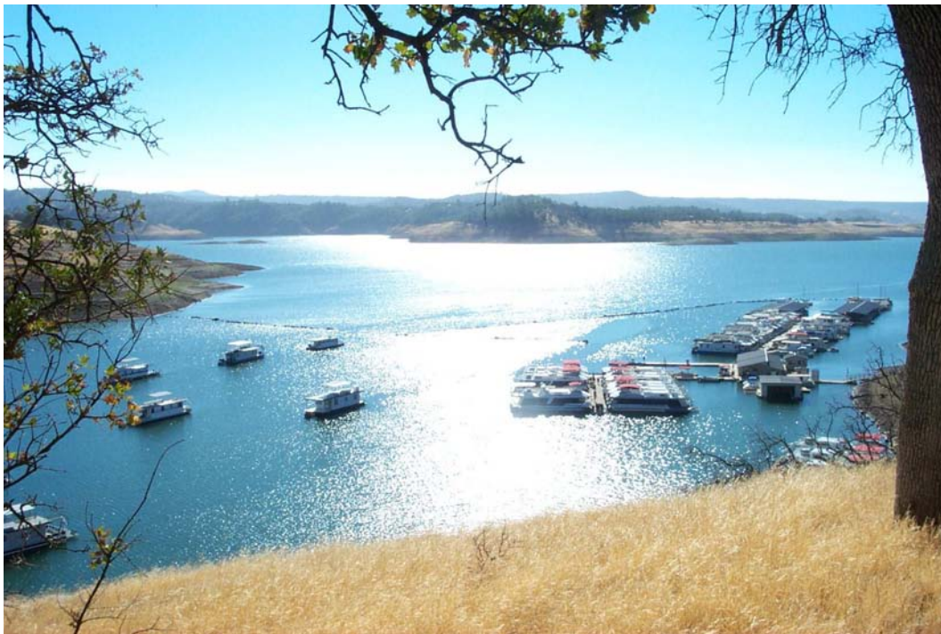
Photograph 18. Glory Hole Marina.