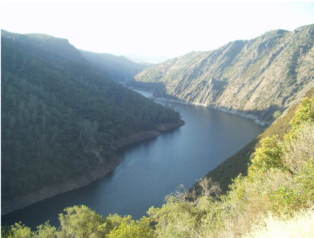
Photograph 2. Steep slopes along the North Fork of the Stanislaus River near Rose Creek.