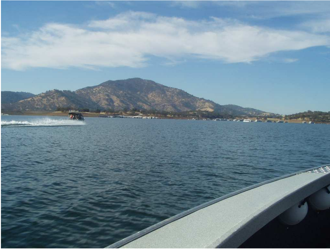
Photograph 11. Northwest view of Glory Hole Marina from the lake.