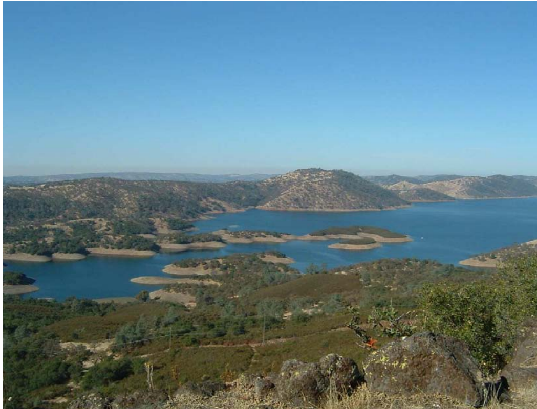
Photograph 12. View of New Melones Lake and powerline right-of-way from Table Mountain.