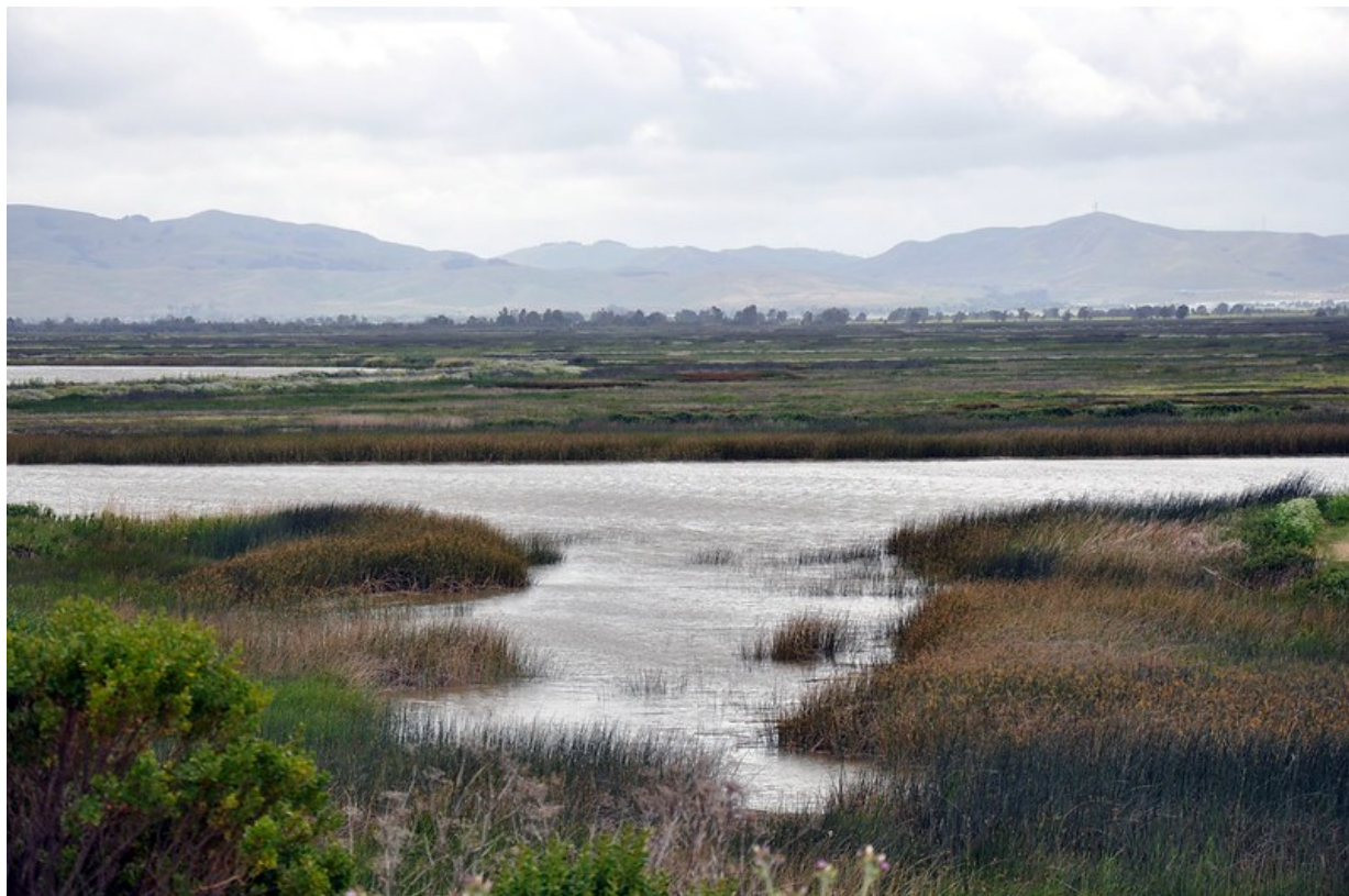
Suisun Marsh

Reclamation’s formulation of alternatives took into account the fact that the status of listed species has been driven by many factors beyond Reclamation’s control to address through operations, including dam and levee construction, urbanization, invasive species, and other land and water use changes. In the 1930s, Congress authorized the initial features of the Central Valley Project, and the United States began construction of Shasta Dam and Folsom Dam. The United States completed construction of Shasta Dam in 1945 and Folsom Dam in 1956. Congress continued to authorize major additions to the CVP over the next several decades, including Keswick Dam on the Sacramento River, Friant Dam on the San Joaquin River, Trinity and Lewiston Dams on the Trinity River, and New Melones Dam on the Stanislaus River. Congress also authorized the Delta Division, which Reclamation uses to divert and deliver water from the Sacramento River to the Tracy Pumping Plant, the Contra Costa Pumping Plants, and the intakes for the Contra Costa and Delta-Mendota Canals.