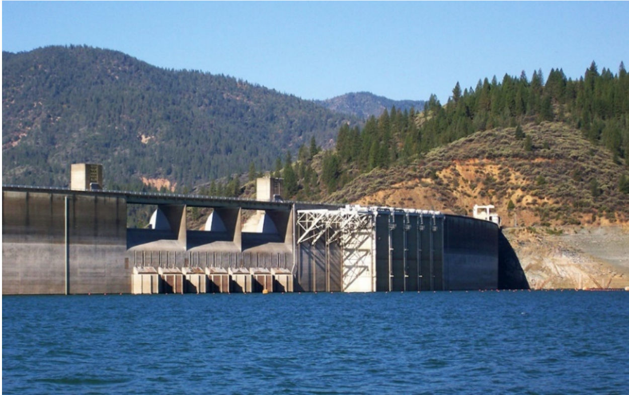
Shasta Dam Temperature Control Device

Trinity River Division —Seasonal operations in Trinity Reservoir would continue to be integrated with Shasta Reservoir operations and Reclamation would continue to implement the Trinity River ROD and lower Klamath River augmentation flows (from the 2017 Lower Klamath ROD), as described in the No Action Alternative. Whiskeytown Reservoir operations would be similar to those described for the No Action Alternative, with minor changes to accommodate Clear Creek flow measures for attraction flows and geomorphic flows. Habitat restoration and spawning gravel replenishment would continue. Western yellow-billed cuckoo surveys would be conducted.