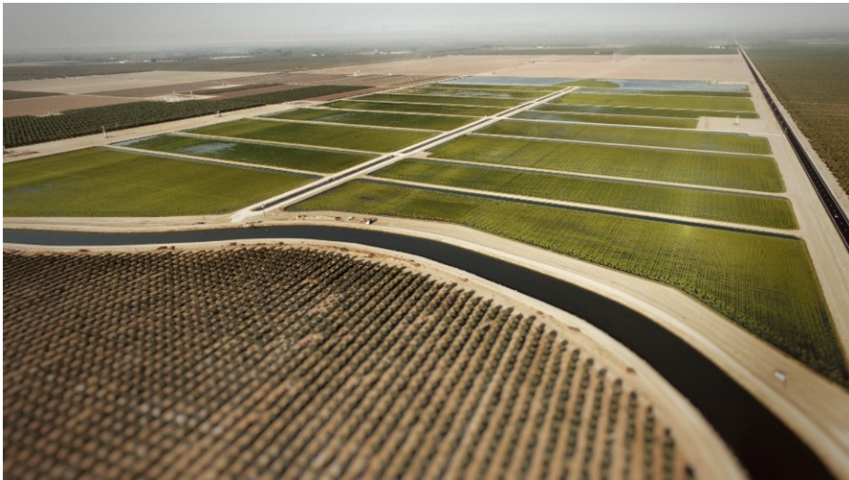
Friant-Kern Canal (Shafter-Wasco Irrigation District)

The Central Valley Project (CVP) is one of the Bureau of Reclamation's (Reclamation) largest and most important water projects, storing and delivering nearly 12 million acre-feet of water in support of California's farms, cities, wildlife refuges, and fish and wildlife. Reclamation serves these water supply needs through the balancing of competing statutory responsibilities. Reclamation's goal is to provide and enhance water and hydropower reliability for California communities, agriculture, fisheries, and wildlife refuges, in accordance with its statutory responsibilities, including compliance with Endangered Species Act (ESA) requirements for listed species within the project area.