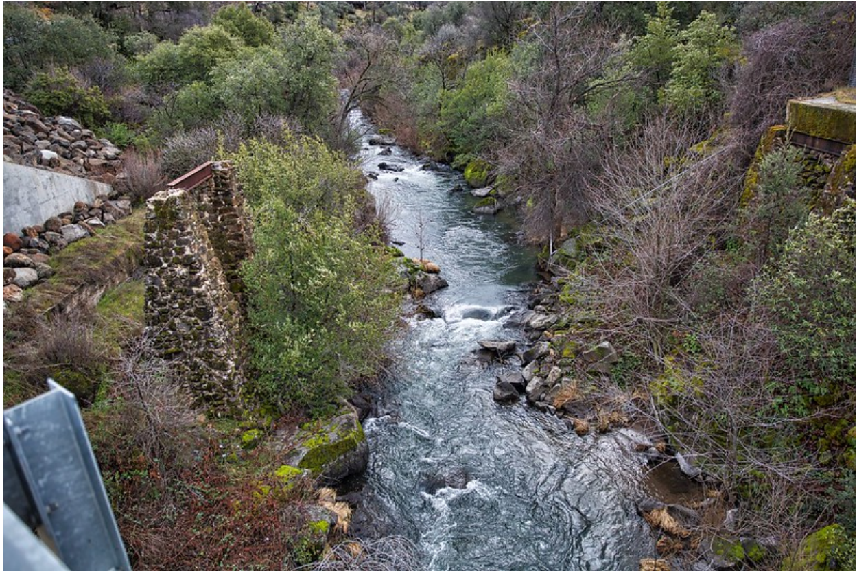
Battle Creek