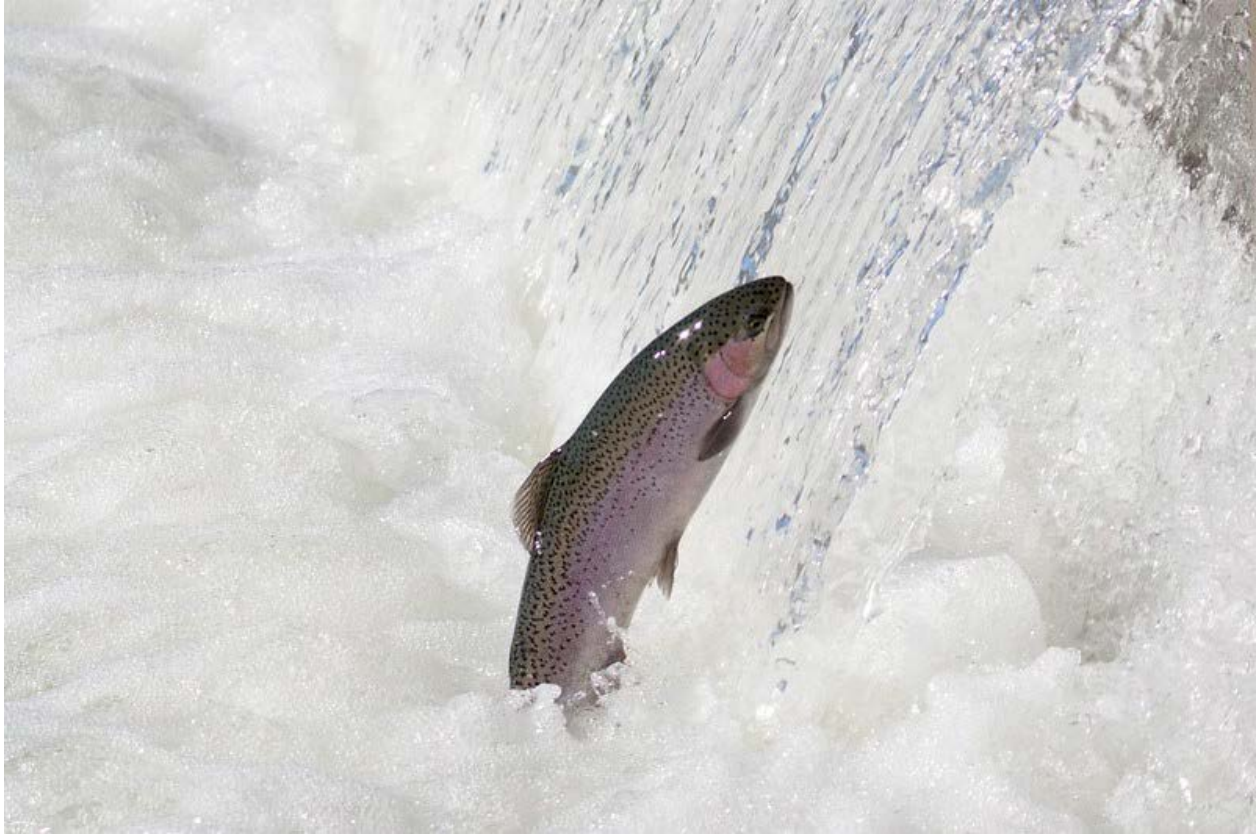
Steelhead at Coleman National Fish Hatchery

The updated science recognizes the importance of prioritizing the early life stages for winter-run Chinook salmon. The new science shows a need for colder water temperatures than called for in the 2009 Biological Opinion and the recent drought identified a need for better strategies when sufficient cold water is not available. The Decision increases cold water storage and makes operational adjustments to release colder water with a focus on the location of redds, as well as making better use of the available pool through a tiered approach that targets the most sensitive egg incubation stages when water supplies are limited. Temperature management will be based on real-time information showing that winter-run Chinook salmon have spawned, which will avoid unnecessary releases of water on a specific calendar date, as directed in the 2009 Biological Opinion. Alternative 1 provides commitments based on beginning of May storage and does not rely upon speculative modeling assumptions before the available cold water is known. The Decision is more efficient and effective for winter-run incubation than the No Action or other alternatives. Shasta Cold Water Pool management also includes performance measures for temperature dependent mortality and total egg to fry survival.