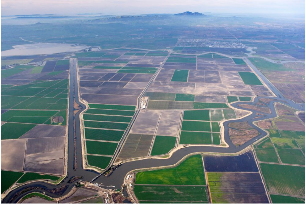
Old and Middle River of the San Joaquin-Sacramento Bay-Delta (Contra Costa Water District)