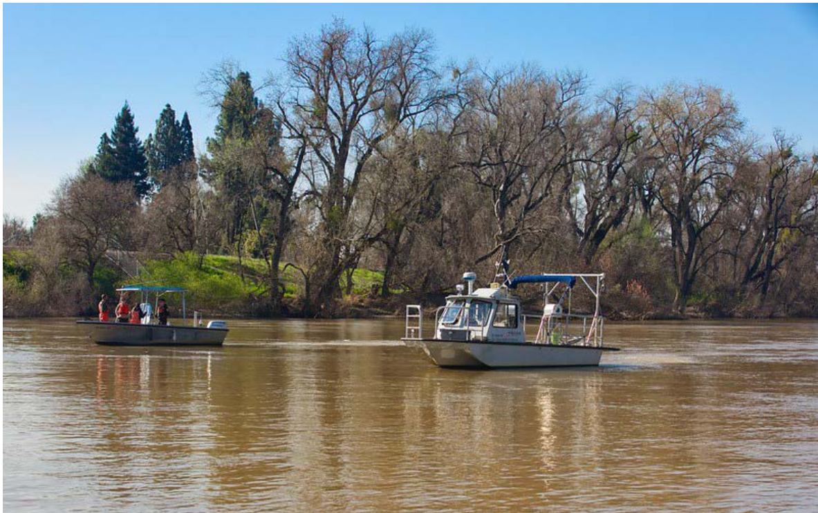
Enhanced Delta Smelt monitoring (USFWS)

This Decision is expected to modernize Reclamation’s operations by integrating real-time monitoring and real-time operations to enhance operations. It better reflects the complexity of the Projects where Reclamation operators must address multi-purpose uses, multi-species’ needs, and multi-year actions, while complying with federal and state obligations, including coordination with DWR. Reclamation’s sound, scientifically-based approach should benefit both ecosystem needs and water supply, including commitments to ESA compliance actions to meet the needs of threatened and endangered species. Based on prior spending by Reclamation, DWR and water users, these measures entail an estimated $1.5 billion expenditure, with an anticipated $15 million annually for real-time monitoring.