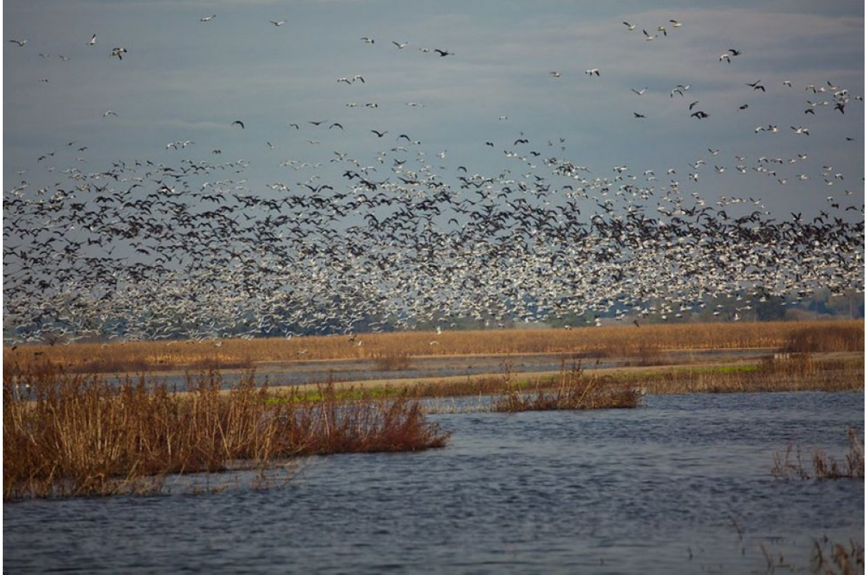
Aleutian and snow geese at San Joaquin National Wildlife Refuge

Reclamation’s proposed modernization of its operations through real-time monitoring and management is expected to result in a more efficient system. The continued existence of dams and other facilities, however, limit Reclamation’s ability to address legacy impacts simply through delivery of operational flows. Proposed changes to operations to comply with the ESA relied on the best available science, and on the combined expertise of agency professionals with decades of experience at USFWS, NMFS, Reclamation and DWR. Reclamation used the new scientific data and advancements in real-time monitoring capacity to propose a strategy that it anticipates will allow it to better operate in real time, imposing operational restrictions only when necessary to address the needs of listed species.