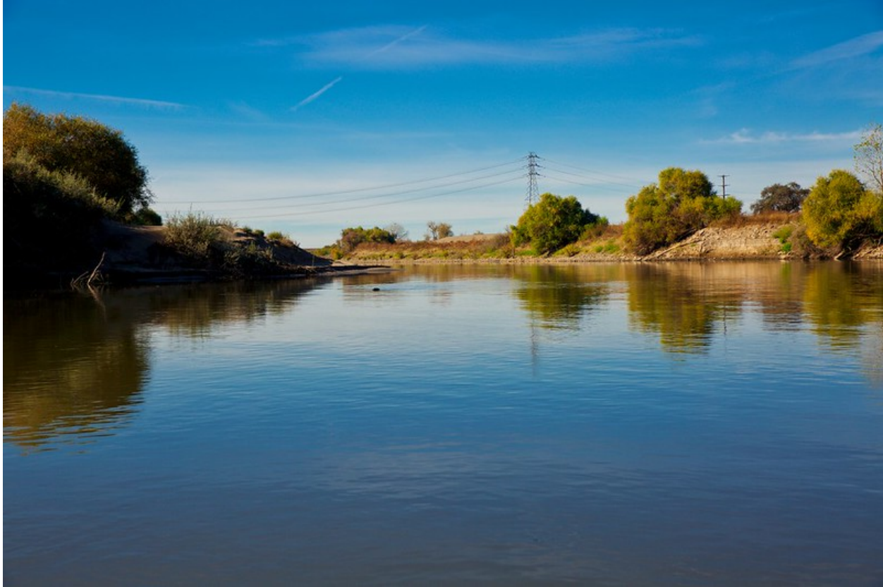
San Joaquin River (USFWS)

For governance of Alternative 1, Reclamation would work with DWR, NMFS, USFWS, CDFW, public water agencies, and other participants to manage operations in multiple ways. Key governance functions include core operation, scheduling, collaborative planning, and compliance and performance reporting. Core water operations would be based on real-time monitoring; scheduling recommendations would be provided by fishery agencies and water users in watershed-based groups to Reclamation and DWR on duration, timing, and magnitude of specific blocks of water; collaborative planning would be used to pursue and implement certain actions with the goal of continuing to identify and undertake actions that benefit listed species; and compliance and reporting by Reclamation and DWR would occur on water operations and fish performance seasonally and in an annual summary. Other key governance functions that would be included are drought and dry year actions, chartering of independent panels to review certain components of the alternative, and four-year reviews by an independent panel.