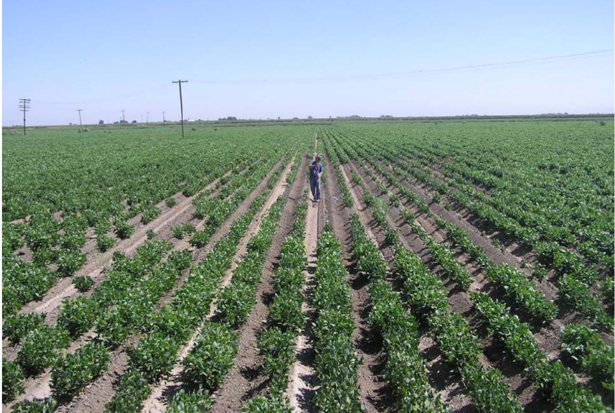
Row crops in California's Central Valley