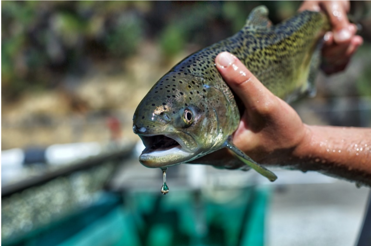
Winter-run Chinook salmon

and developed a plan of operations to better meet these needs. In the preferred alternative, Reclamation commits to an extensive suite of actions over the next decade, in coordination with DWR and water users, to address ESA requirements for threatened and endangered fish as well as other measures that address legacy landscape-level impacts that are not attributable to current operations.