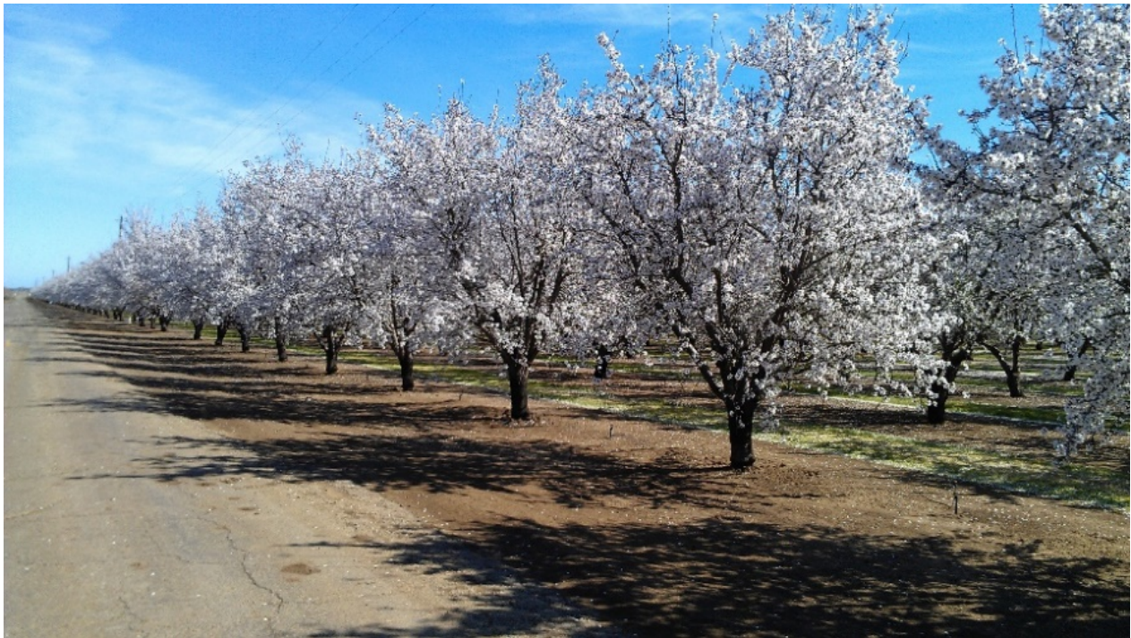
Almond orchard in bloom in California’s Central Valley

for users by increasing flexibility and without adversely affecting listed species beyond what is anticipated over the duration of the Biological Opinions. Measures included in the WIIN Act include Section 4001, which directed that the Secretary of the Interior and the Secretary of Commerce “shall provide the maximum quantity of water supplies practicable” to CVP water users by authorizing approval of operations or temporary projects, including developing real-time monitoring capabilities for the Delta cross-channel gates. Section 4002(a) directs the Secretaries of Commerce and the Interior to manage water supplies at the most negative flow rate (rate of pumping) allowed under the applicable Biological Opinions to maximize water to users. Section 4003 of the WIIN Act authorizes Reclamation and DWR to provide for operations of the CVP and SWP at levels that allow, under certain circumstances, OMR flows to be higher than the most negative reverse flow allowed under the Biological Opinions. Section 4004 of the WIIN Act provided direction that federal agencies should consult and cooperate with state and local agencies, and public water agencies that have water contracts with the CVP and SWP, including opportunities to submit information and to review and comment on any biological opinions.