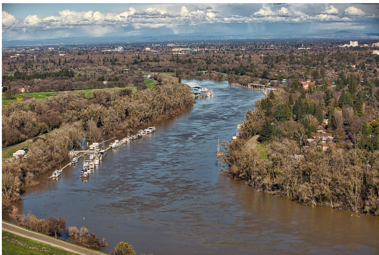
Sacramento River

Reclamation and DWR would operate the CVP and SWP in a manner that maximizes exports while supporting the rearing and migration of fish through the Delta and protecting critical habitat. Under Alternative 1, OMR flows would be managed through protective criteria with real-time adjustments in response to physical and biological criteria in order to limit entrainment risk and keep salvage at or below that of the previous 10 years. Alternative 1 would also include studies to understand how operations interact with fisheries. These studies include developing additional protective measures for larval and juvenile Delta Smelt, providing a population level estimate of Steelhead, and exploring methods to develop a performance measure for spring-run Chinook salmon. Reclamation and DWR would use structured decision-making to implement Delta Smelt summer and fall habitat actions.