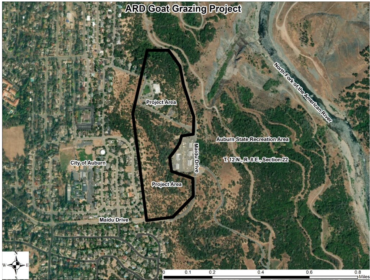
Figure 1. Project Area