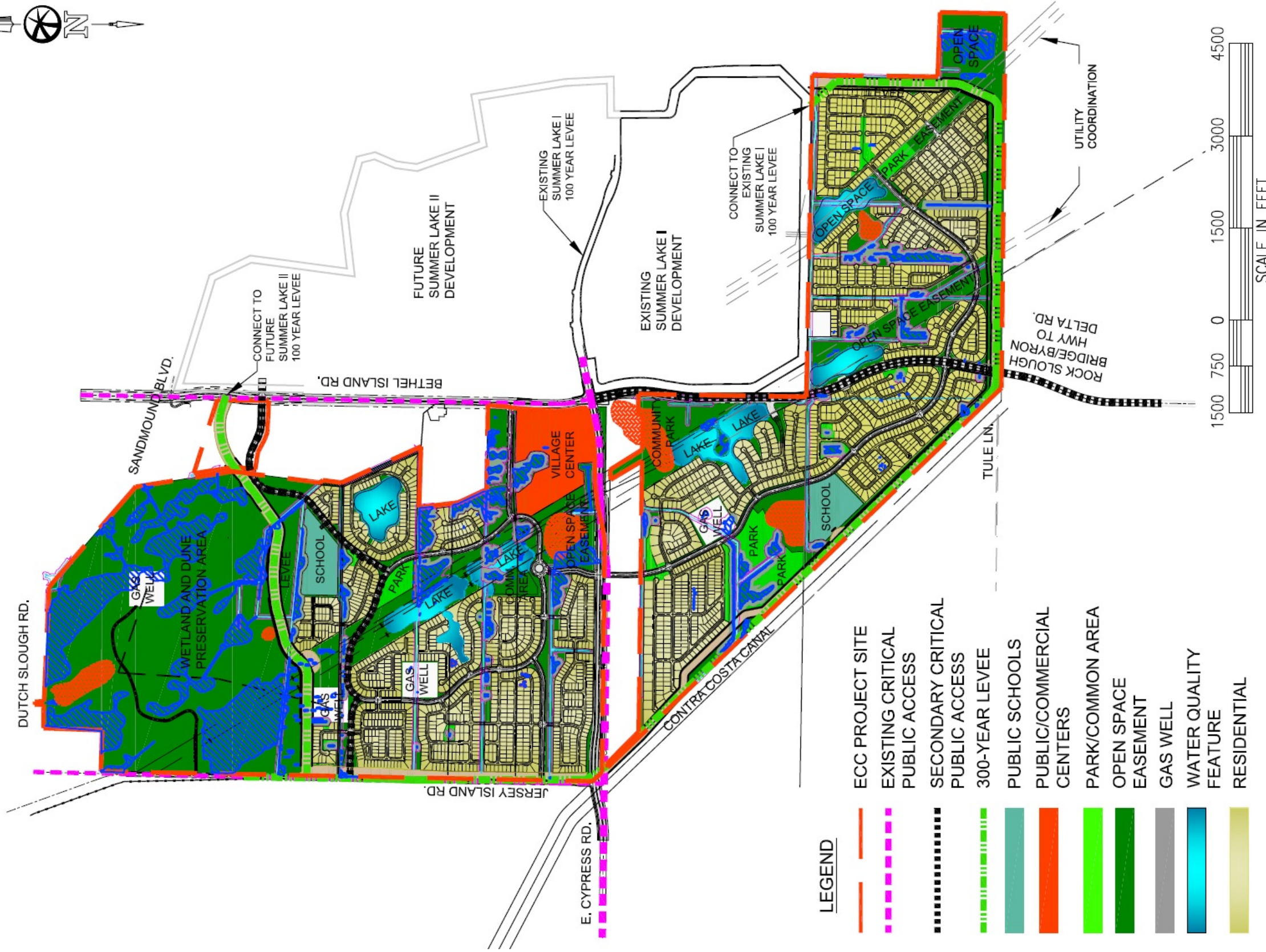
Figure 2 – Site Map