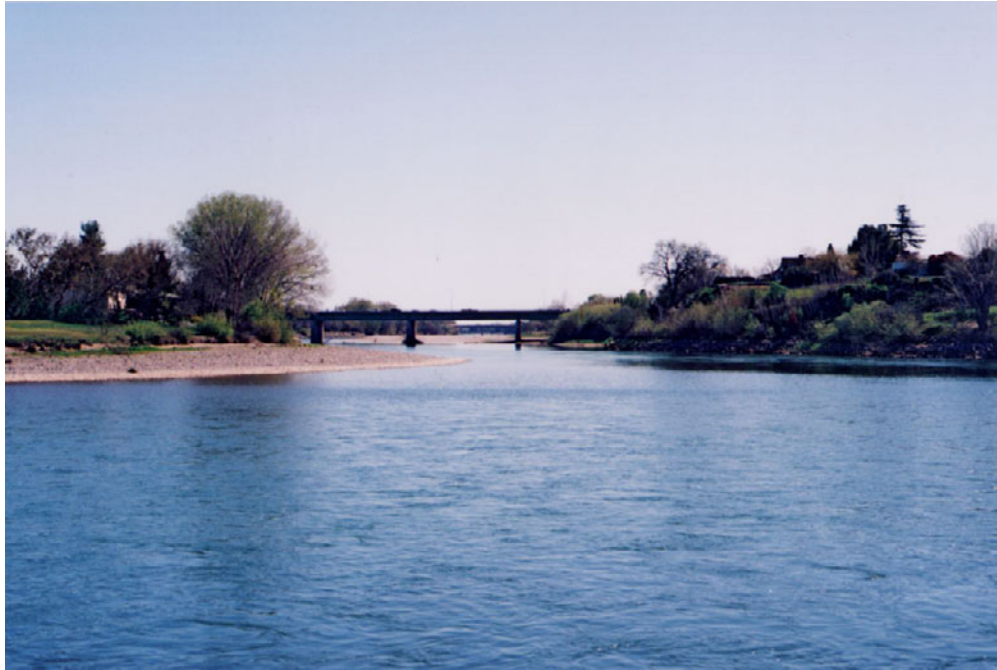
FIGURE 3.12-30A VIEW FROM VIEWPOINT #12 GATES-OUT CONDITION