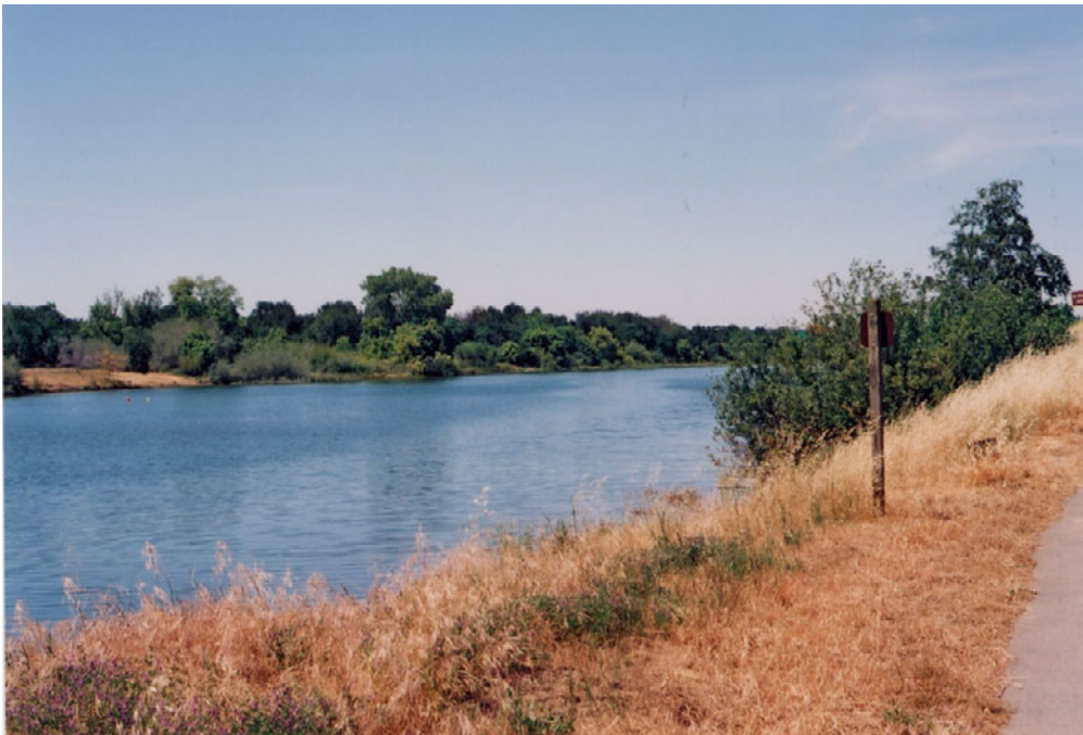
FIGURE 3.12-19B VIEW FROM VIEWPOINT #6, PHOTO 2 GATES-IN CONDITION