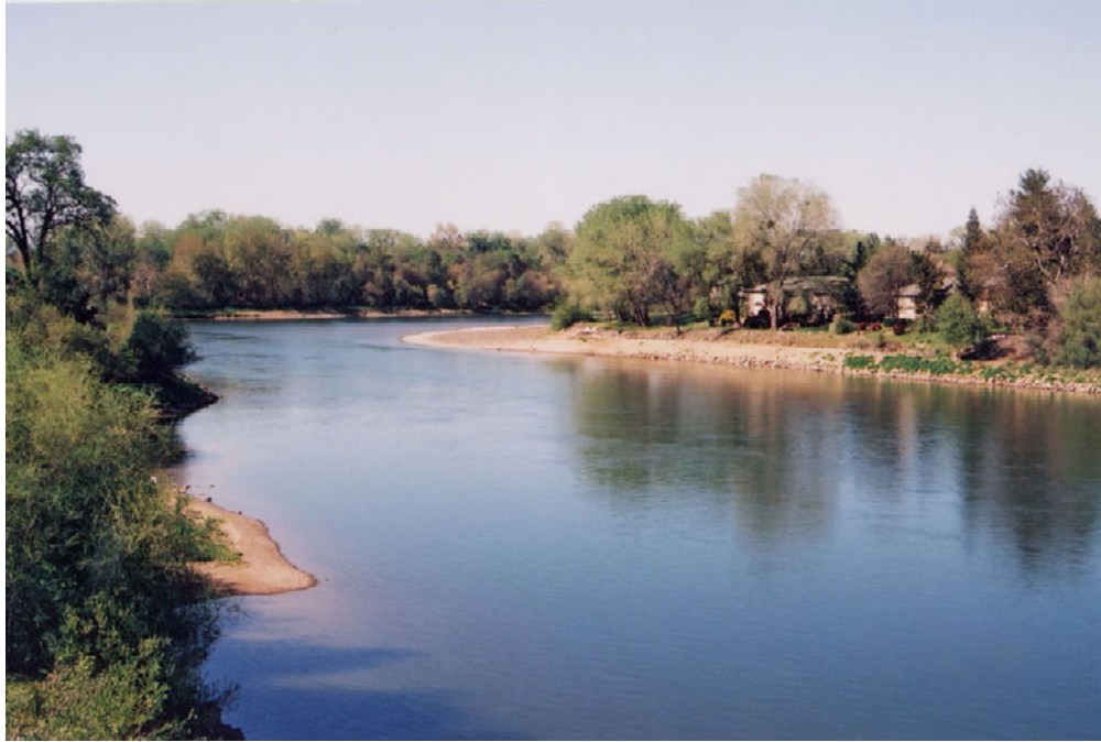
FIGURE 3.12-26A VIEW FROM VIEWPOINT #10, PHOTO 2 GATES-OUT CONDITION