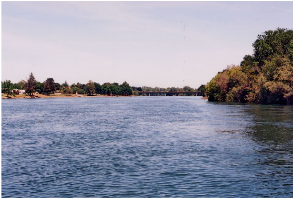
FIGURE 3.12-22B VIEW FROM VIEWPOINT #8 GATES-IN CONDITION