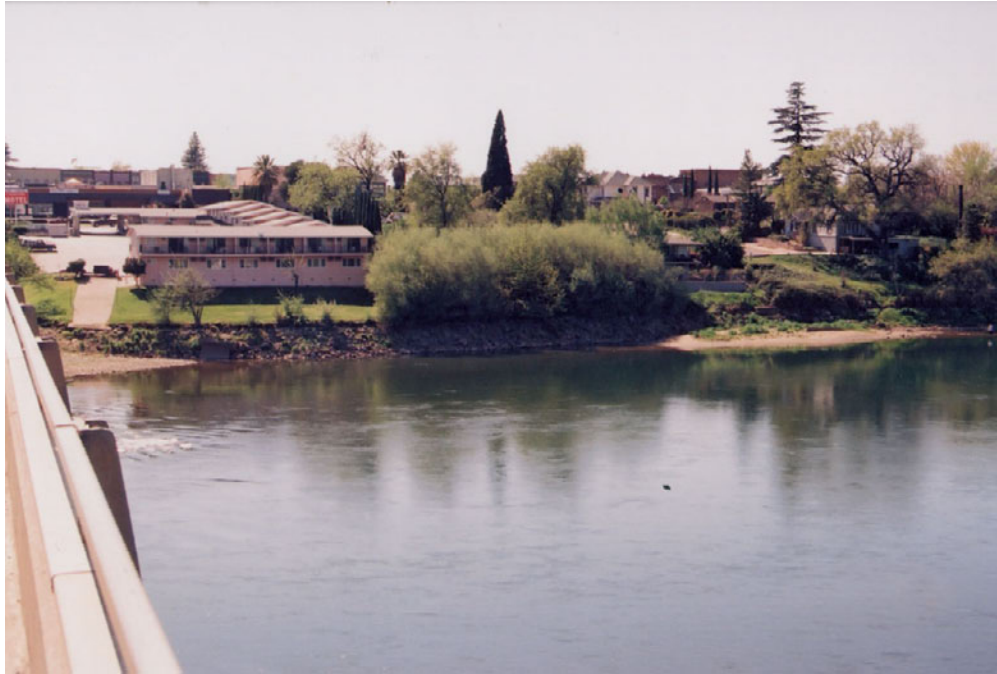
FIGURE 3.12-25A VIEW FROM VIEWPOINT #10, PHOTO 1 GATES-OUT CONDITION