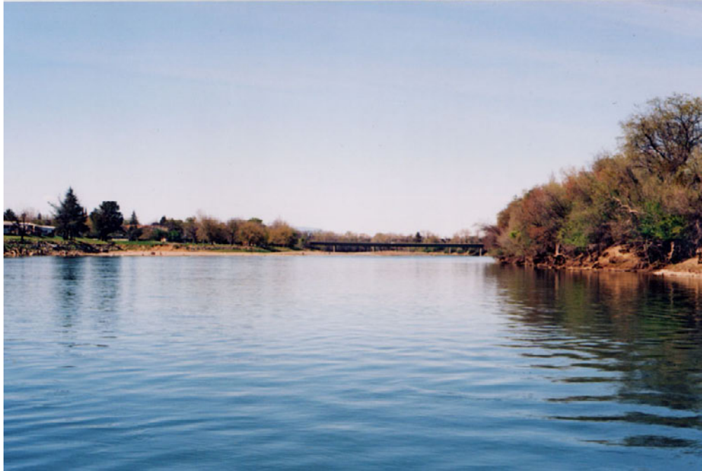
FIGURE 3.12-22A VIEW FROM VIEWPOINT #8 GATES-OUT CONDITION