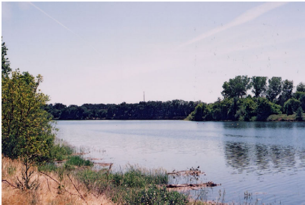
FIGURE 3.12-18B VIEW FROM VIEWPOINT #6, PHOTO 1 GATES-IN CONDITION