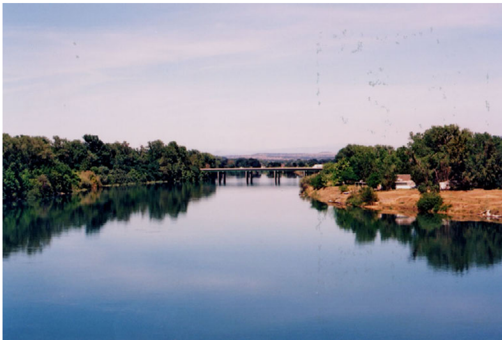
FIGURE 3.12-29B VIEW FROM VIEWPOINT #11 GATES-IN CONDITION