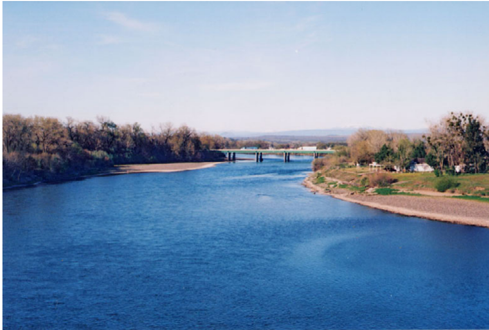
FIGURE 3.12-29A VIEW FROM VIEWPOINT #11 GATES-OUT CONDITION