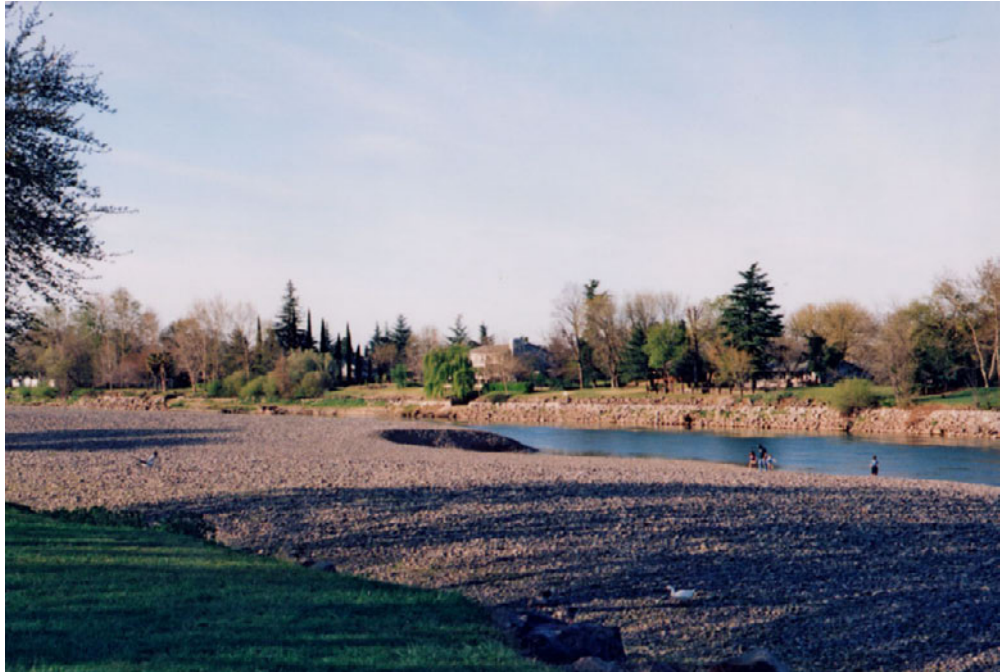
FIGURE 3.12-24A VIEW FROM VIEWPOINT #9, PHOTO 2 GATES-OUT CONDITION