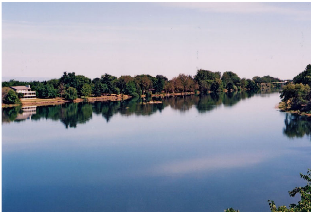
FIGURE 3.12-28B VIEW FROM VIEWPOINT #10, PHOTO 4 GATES-IN CONDITION