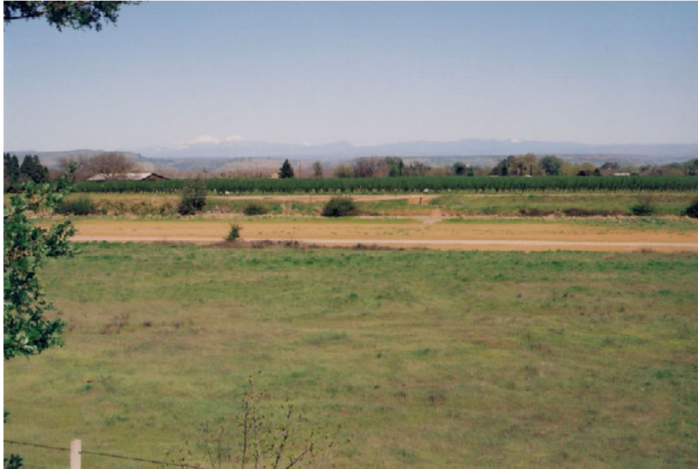
FIGURE 3.12-20A VIEW FROM VIEWPOINT #7 GATES-OUT CONDITION