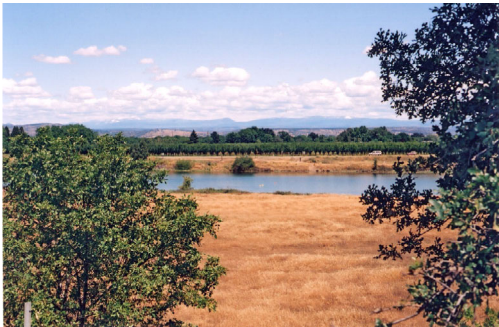
FIGURE 3.12-20B VIEW FROM VIEWPOINT #7 GATES-IN CONDITION