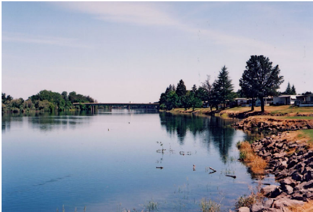
FIGURE 3.12-23B VIEW FROM VIEWPOINT #9, PHOTO 1 GATES-IN CONDITION