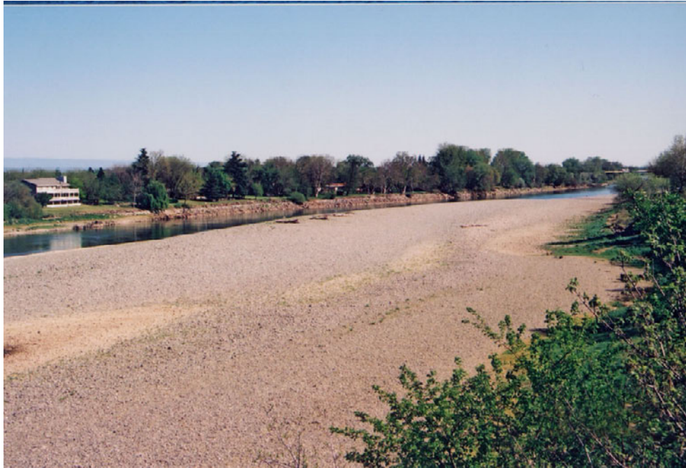
FIGURE 3.12-28A VIEW FROM VIEWPOINT #10, PHOTO 4 GATES-OUT CONDITION