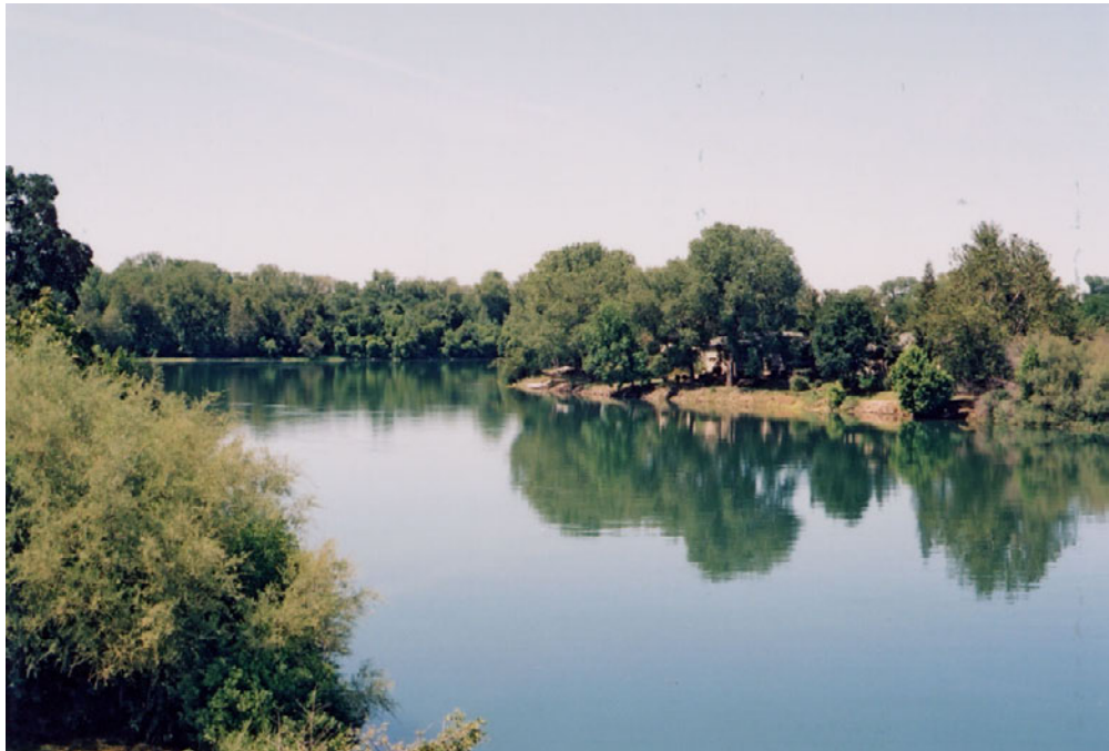
FIGURE 3.12-26B VIEW FROM VIEWPOINT #10, PHOTO 2 GATES-IN CONDITION