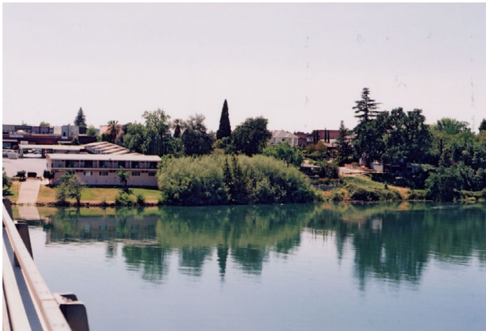
FIGURE 3.12-25B VIEW FROM VIEWPOINT #10, PHOTO 1 GATES-IN CONDITION