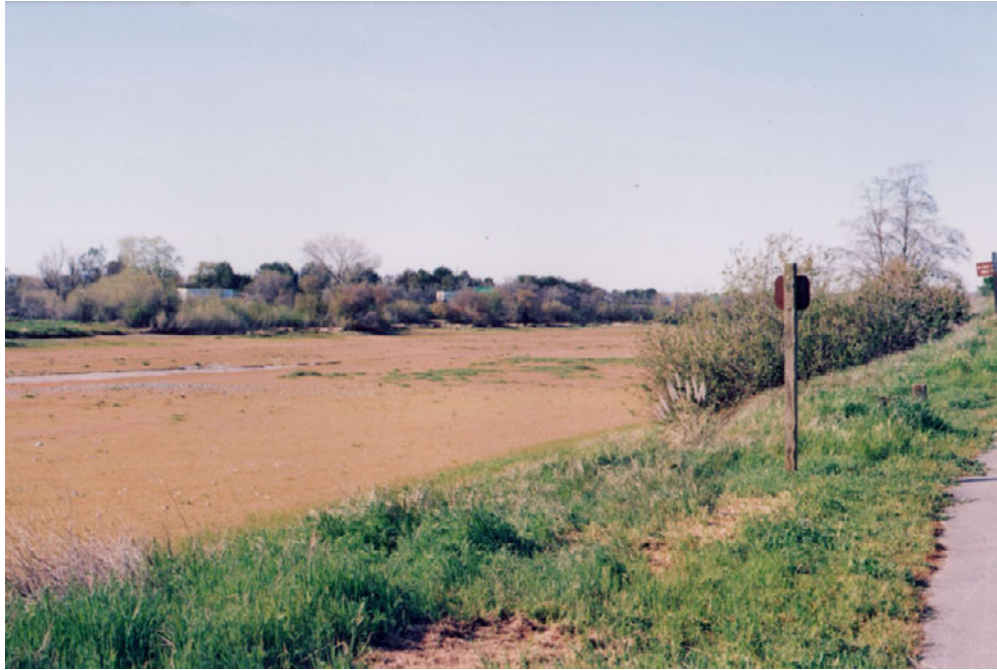
FIGURE 3.12-19A VIEW FROM VIEWPOINT #6, PHOTO 2 GATES-OUT CONDITION