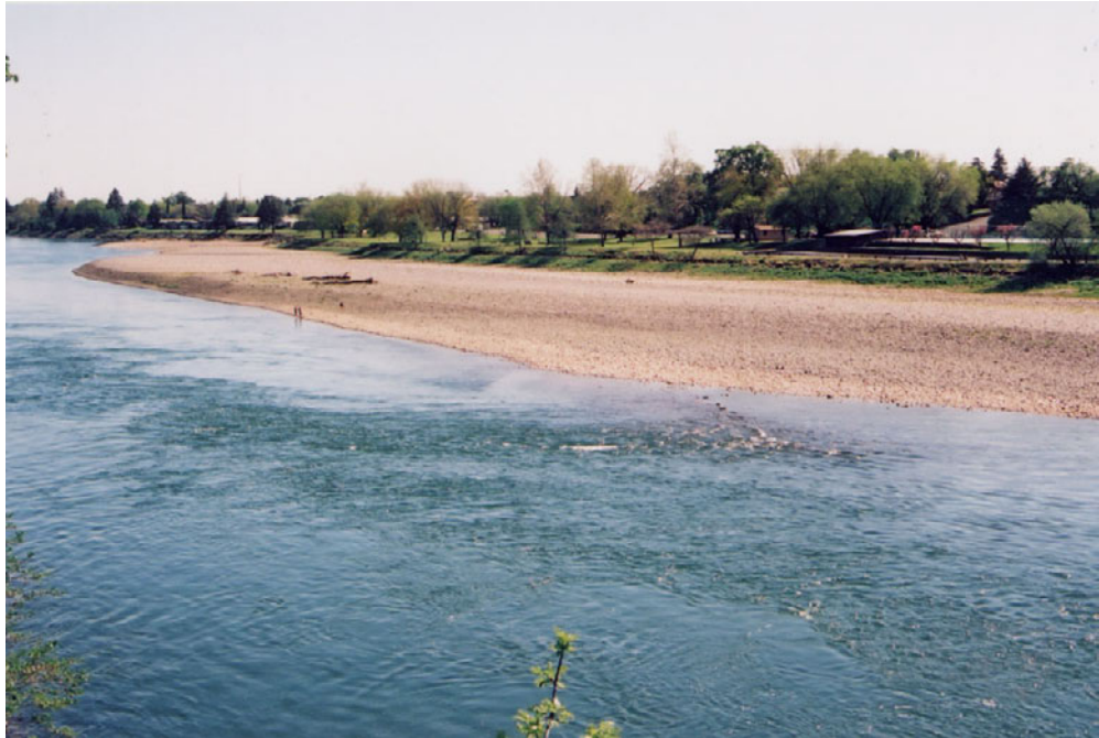
FIGURE 3.12-27A VIEW FROM VIEWPOINT #10, PHOTO 3 GATES-OUT CONDITION