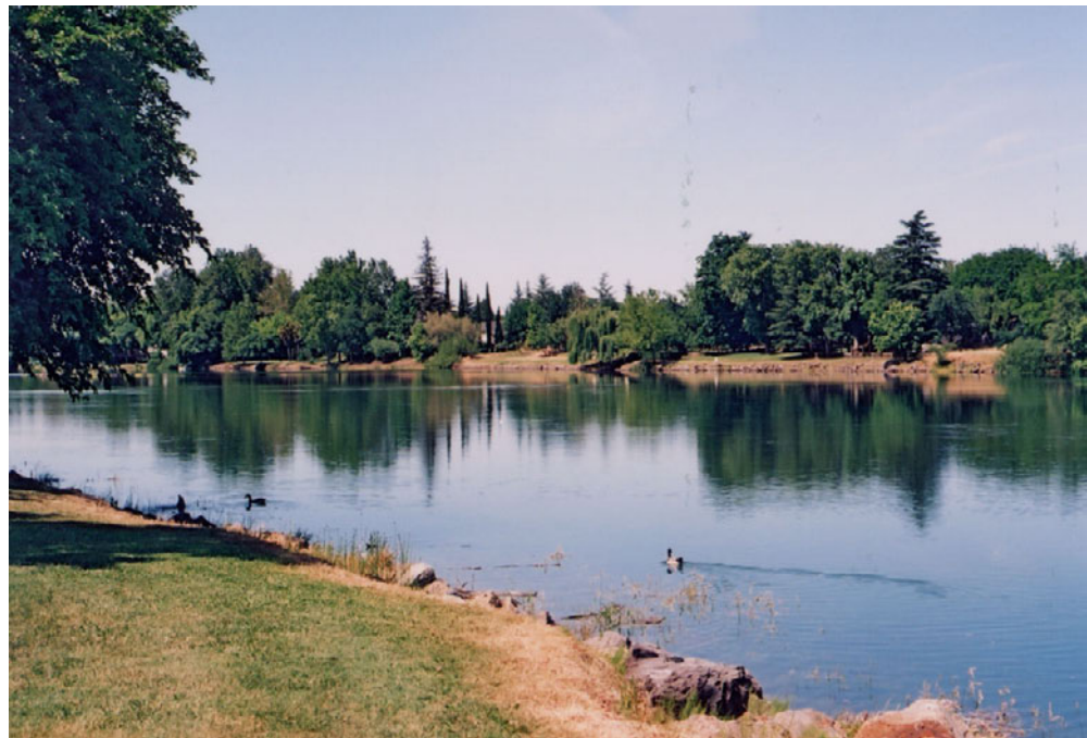
FIGURE 3.12-24B VIEW FROM VIEWPOINT #9, PHOTO 2 GATES-IN CONDITION