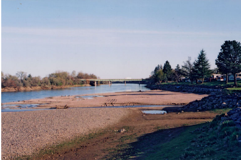
FIGURE 3.12-23A VIEW FROM VIEWPOINT #9, PHOTO 1 GATES-OUT CONDITION