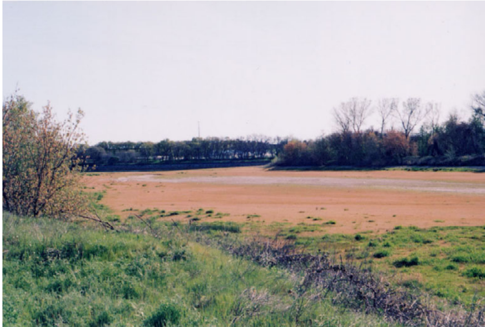
FIGURE 3.12-18A VIEW FROM VIEWPOINT #6, PHOTO 1 GATES-OUT CONDITION