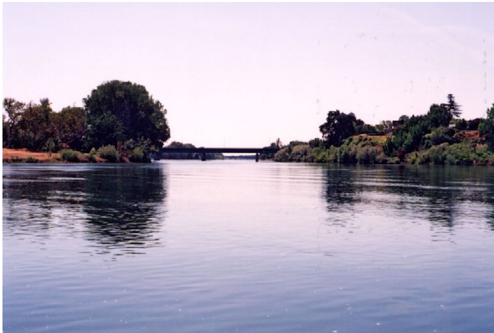
FIGURE 3.12-30B VIEW FROM VIEWPOINT #12 GATES-IN CONDITION