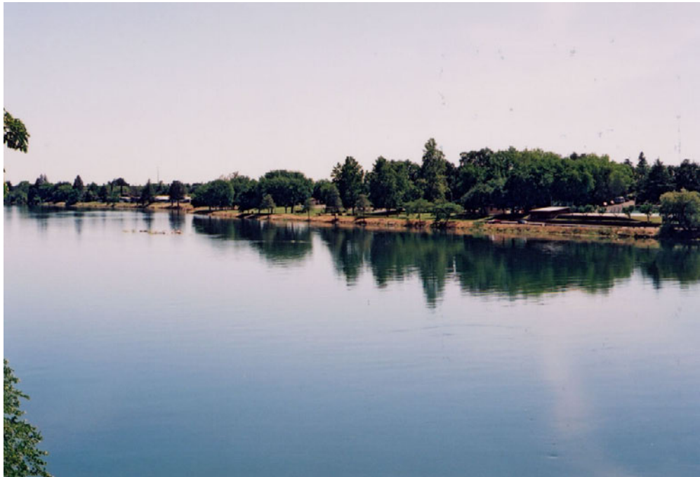
FIGURE 3.12-27B VIEW FROM VIEWPOINT #10, PHOTO 3 GATES-IN CONDITION