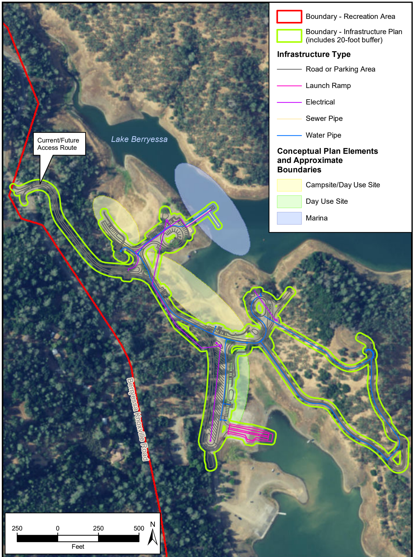
Lake Berryessa Recreation Areas Development