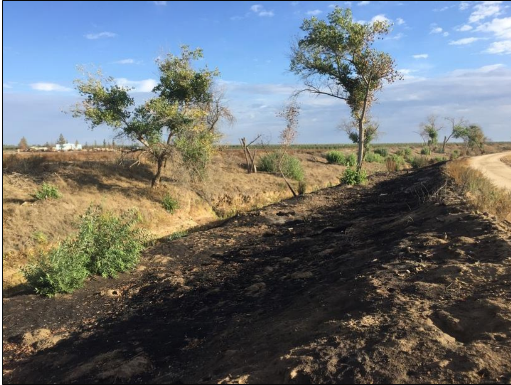
Figure 3. Overview of Deer Creek with the McAnland property, looking northeast, with road on top of berm at left.

The potential for historic properties within the Empire property is therefore considered very low.