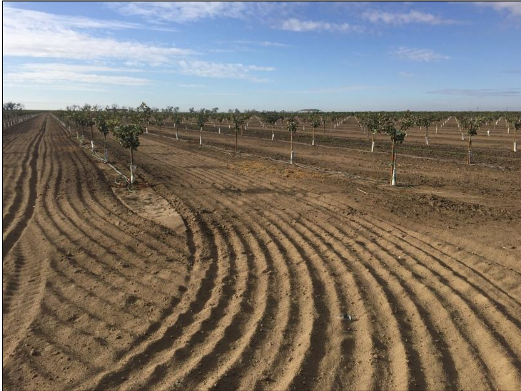
Figure 2b. Recently planted trees on McAnland Property, looking southwest.