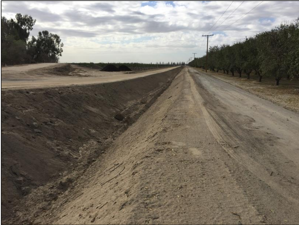
Figure 2d. Harris Ditch overview, looking west.