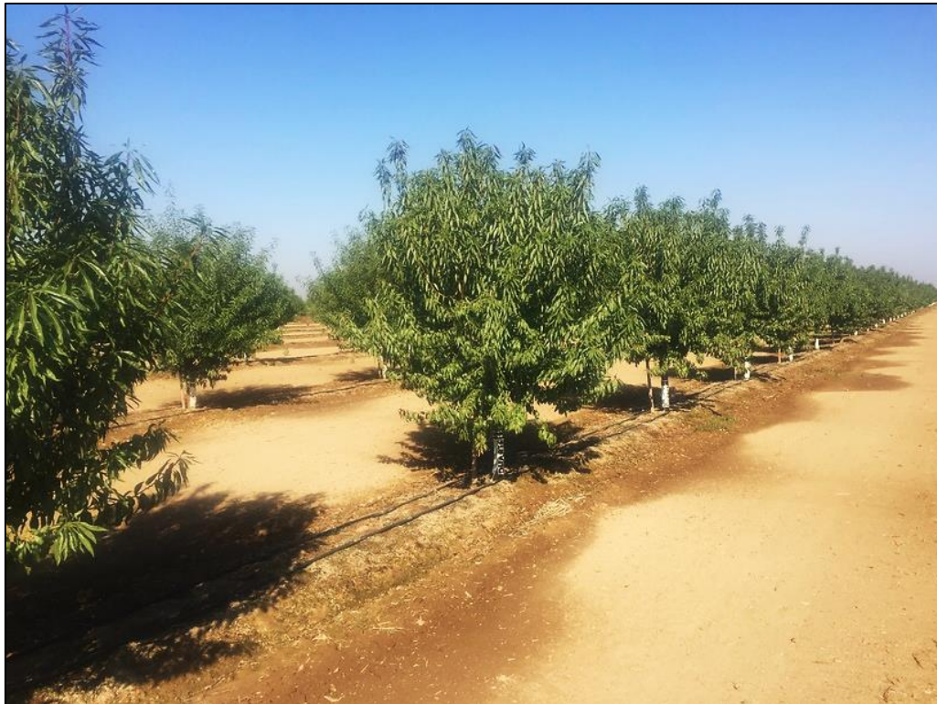
Figure 2c. Orchard at Merritt Property, looking northeast.