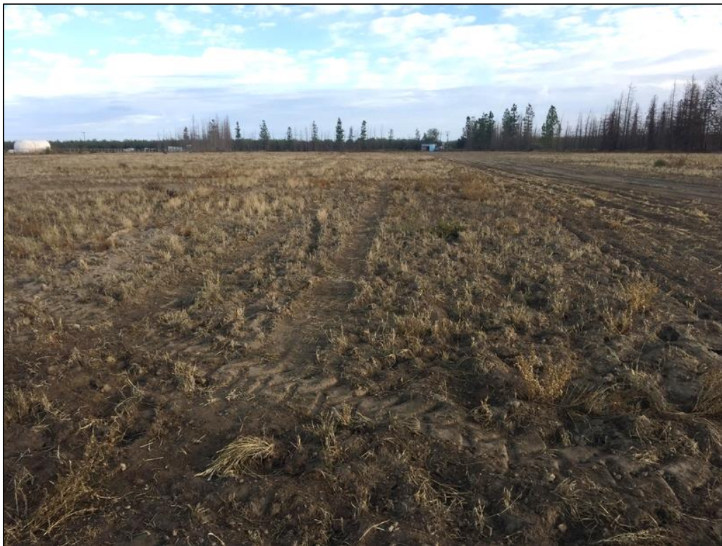
Figure 2a. McAnland Property east end from center of property, looking north.

Based on these factors and conditions, the study area is considered to have a low archaeological sensitivity, with little to no potential for subsurface archaeological remains (see ASM Affiliates 2016:7-8).