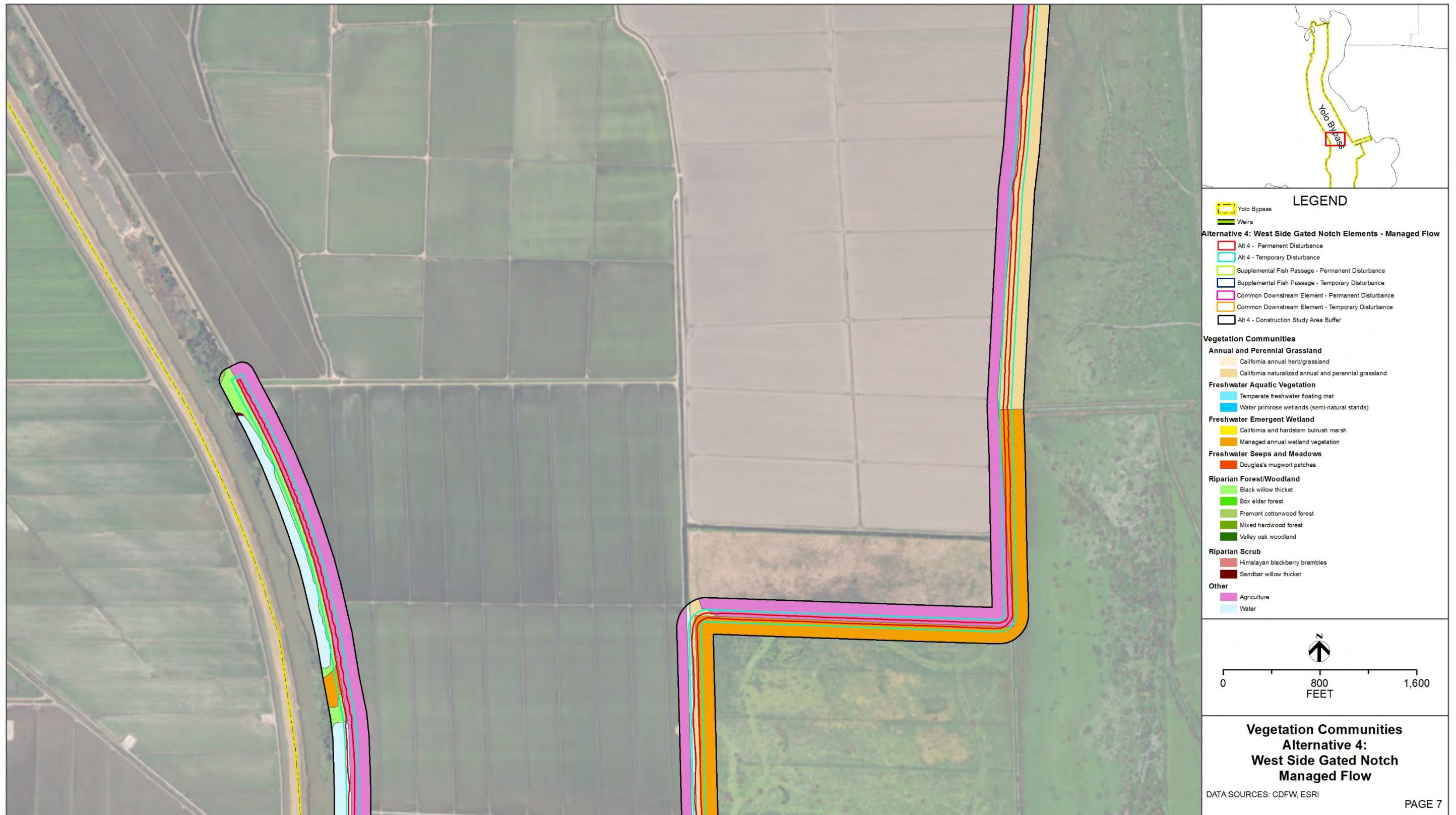
Figure 9-8g. Alternative 4 Construction Impacts to Vegetation Communities