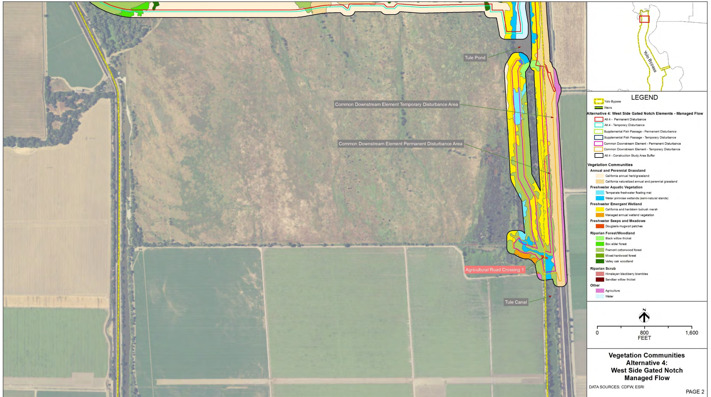
Figure 9-8b. Alternative 4 Construction Impacts to Vegetation Communities