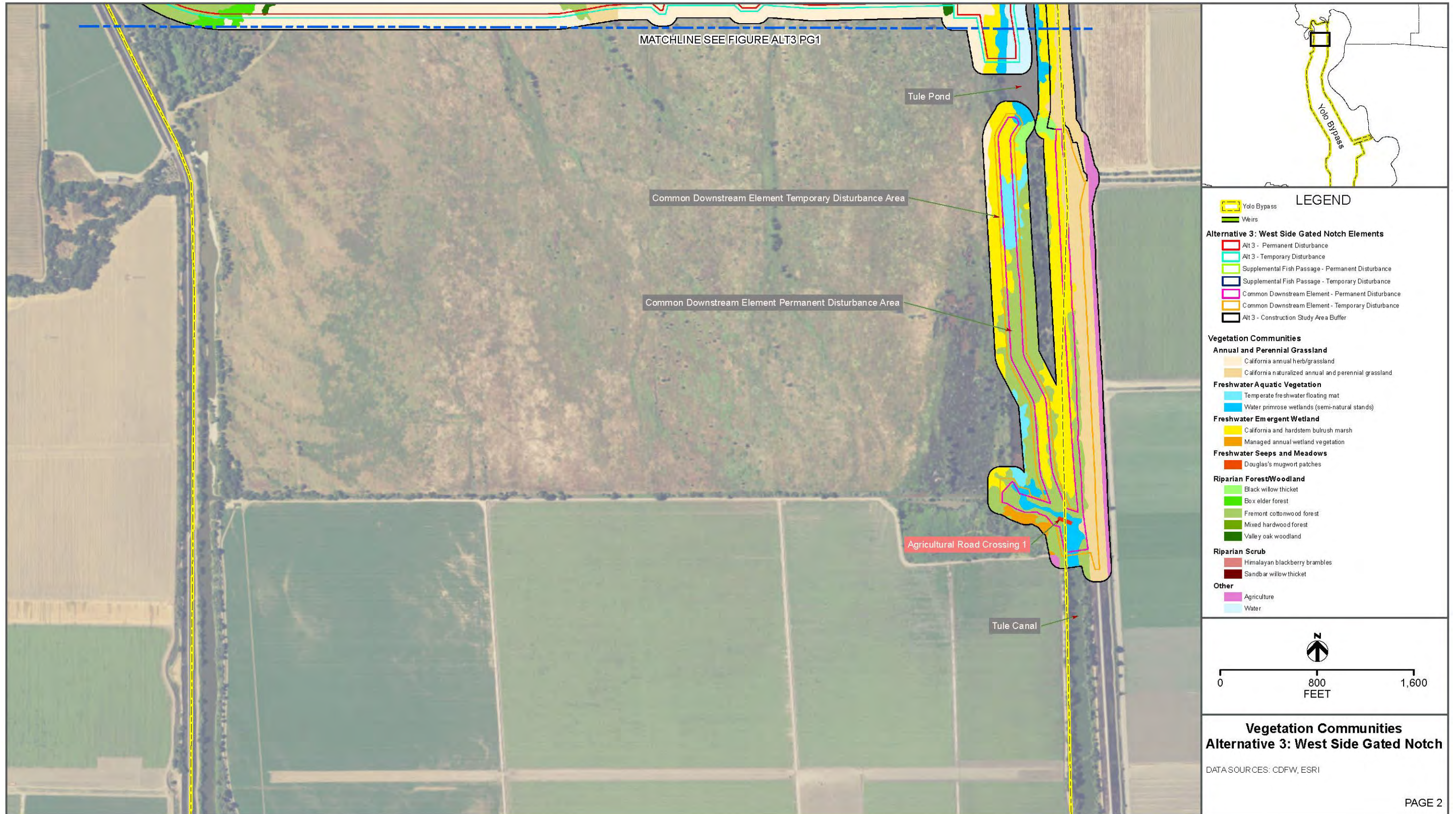
Figure 9-6b. Alternative 3 Construction Impacts to Vegetation Communities