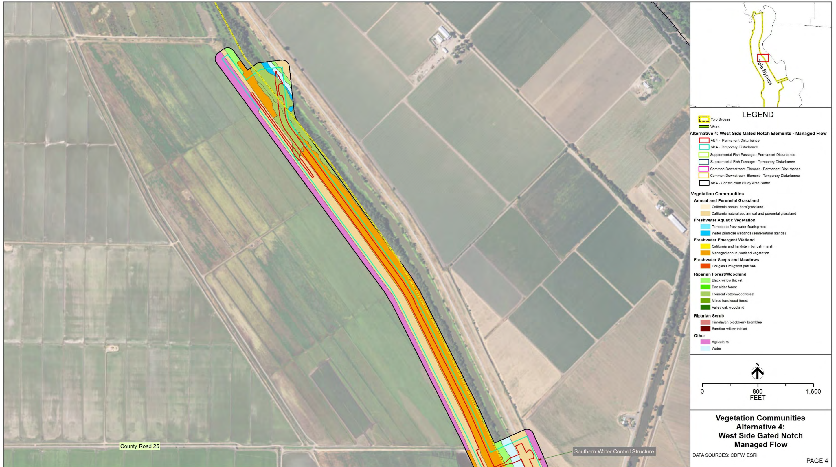
Figure 9-8d. Alternative 4 Construction Impacts to Vegetation Communities