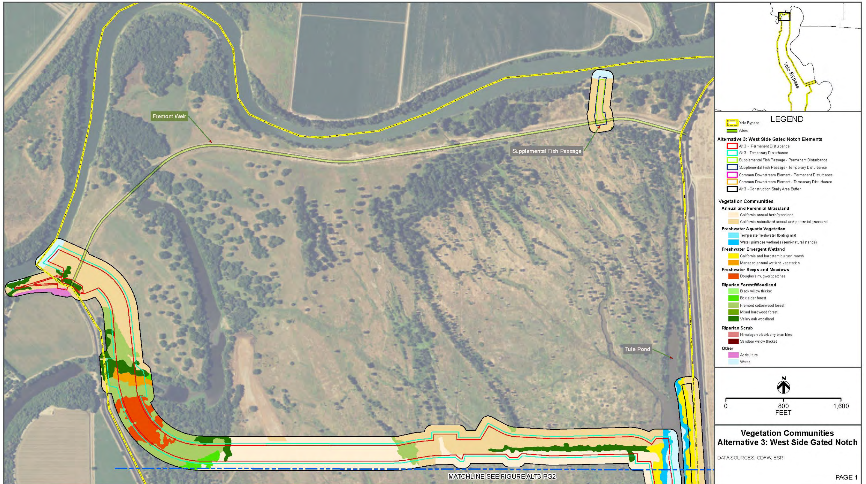
Figure 9-6a. Alternative 3 Construction Impacts to Vegetation Communities