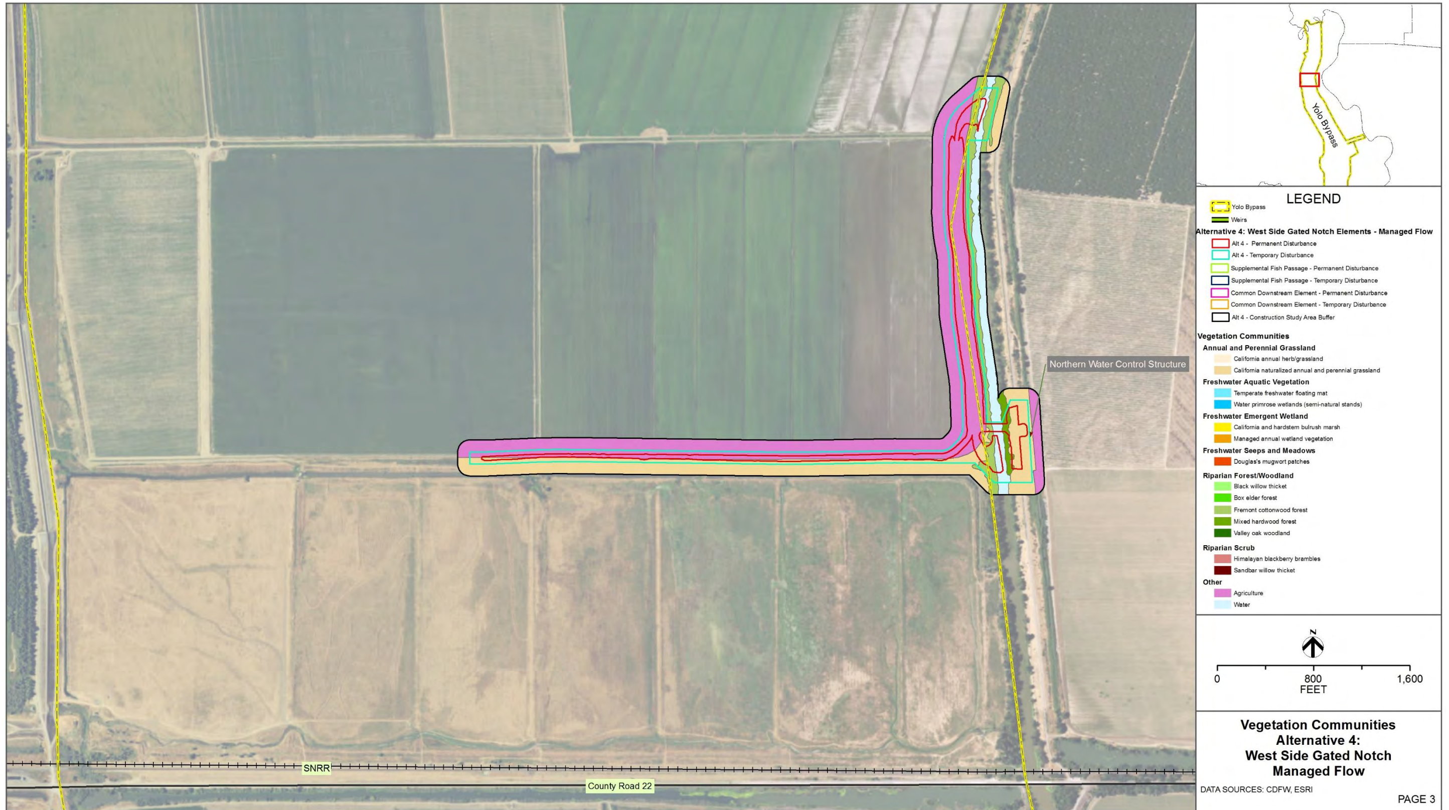
Figure 9-8c. Alternative 4 Construction Impacts to Vegetation Communities