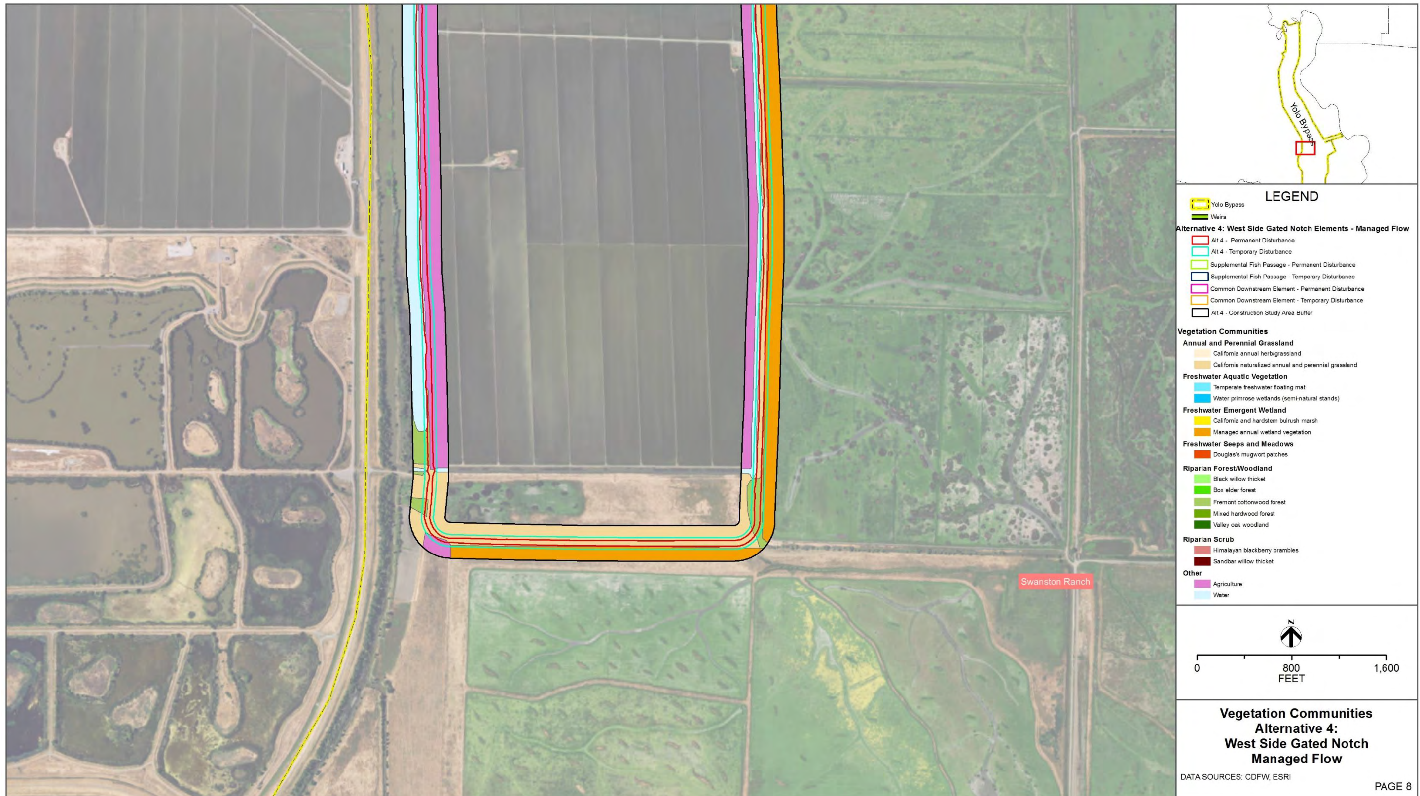
Figure 9-8h. Alternative 4 Construction Impacts to Vegetation Communities