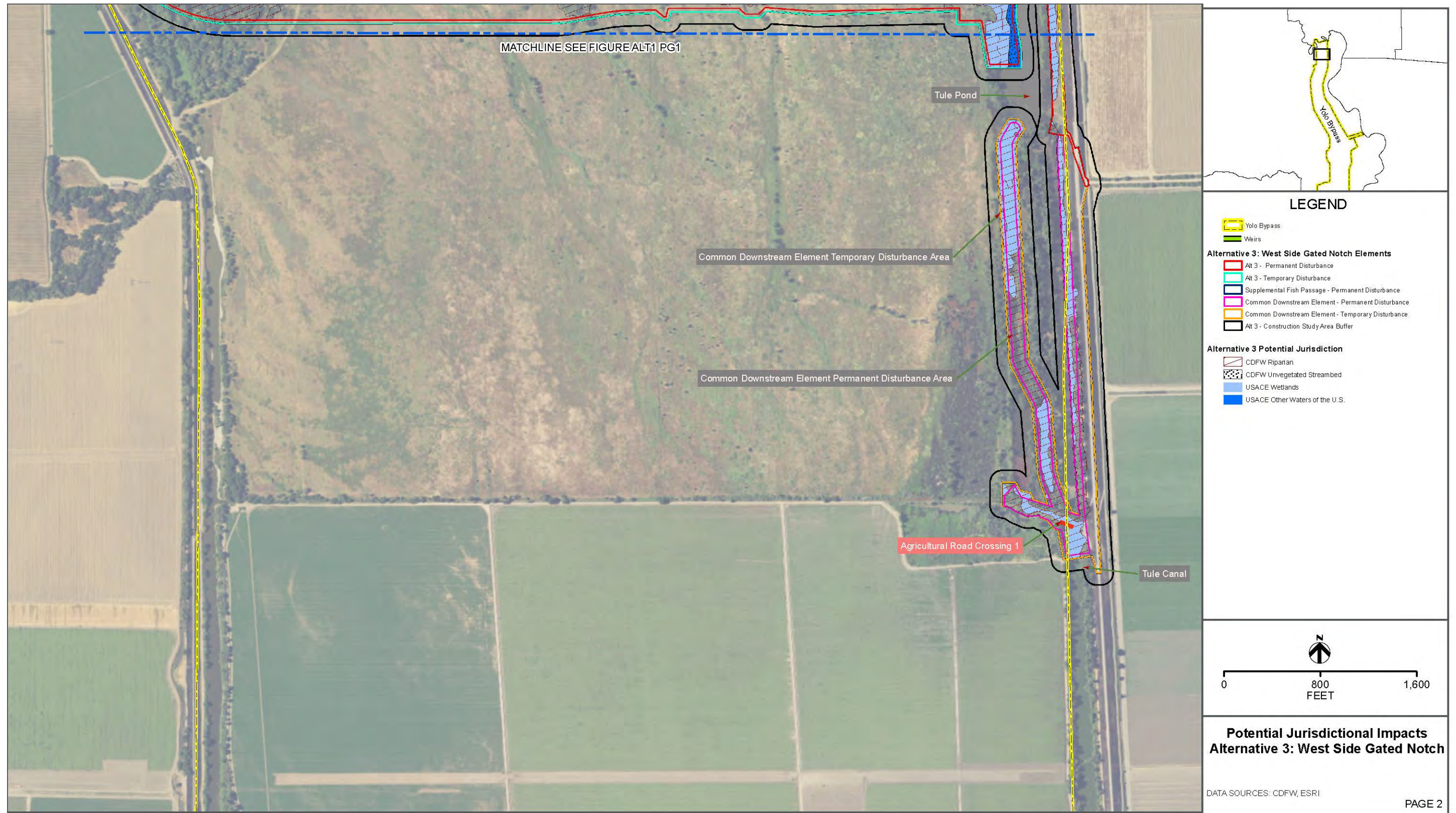
Figure 9-7b. Alternative 3 Construction Impacts to Potential USACE and CDFW Jurisdictional Areas