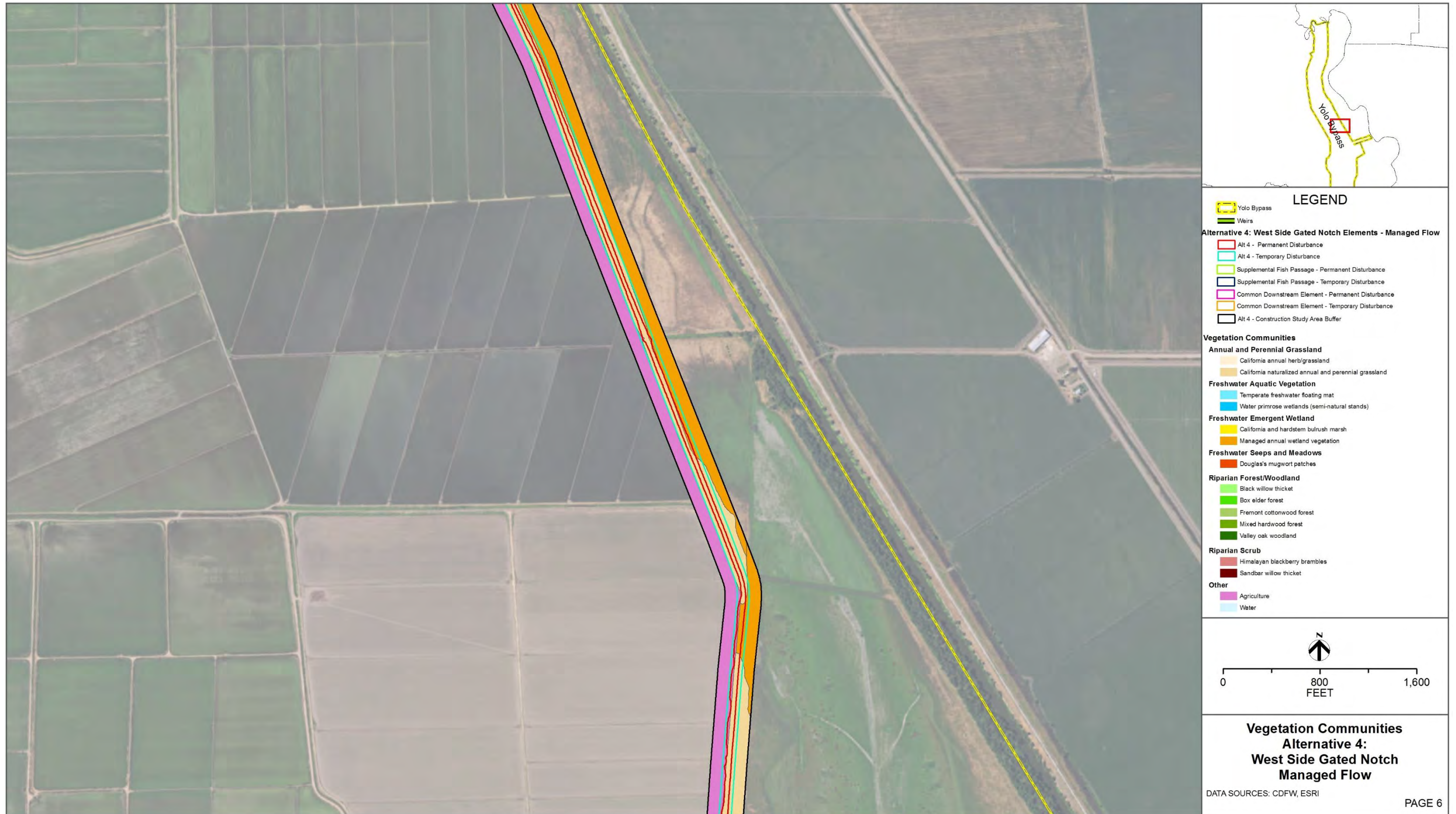
Figure 9-8f. Alternative 4 Construction Impacts to Vegetation Communities