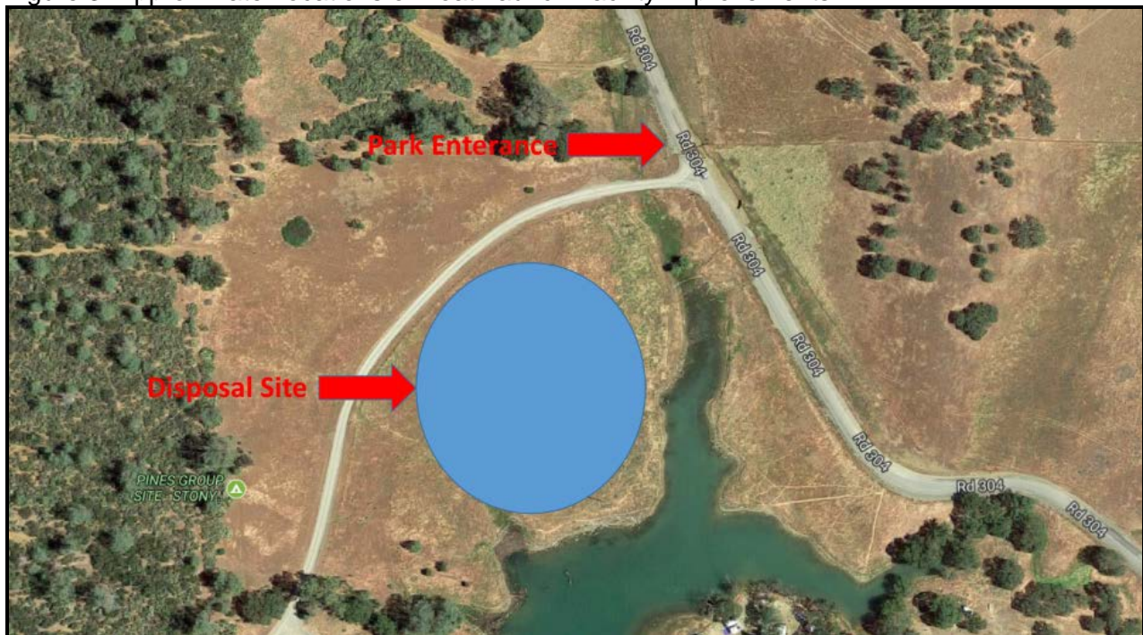
Figure 4. Over-burden disposal site.