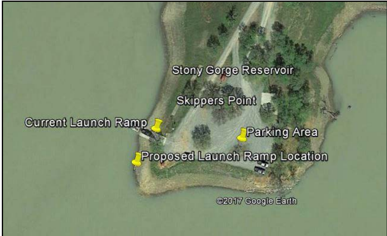
Figure 3. Approximate Locations of Boat Launch Facility Improvements