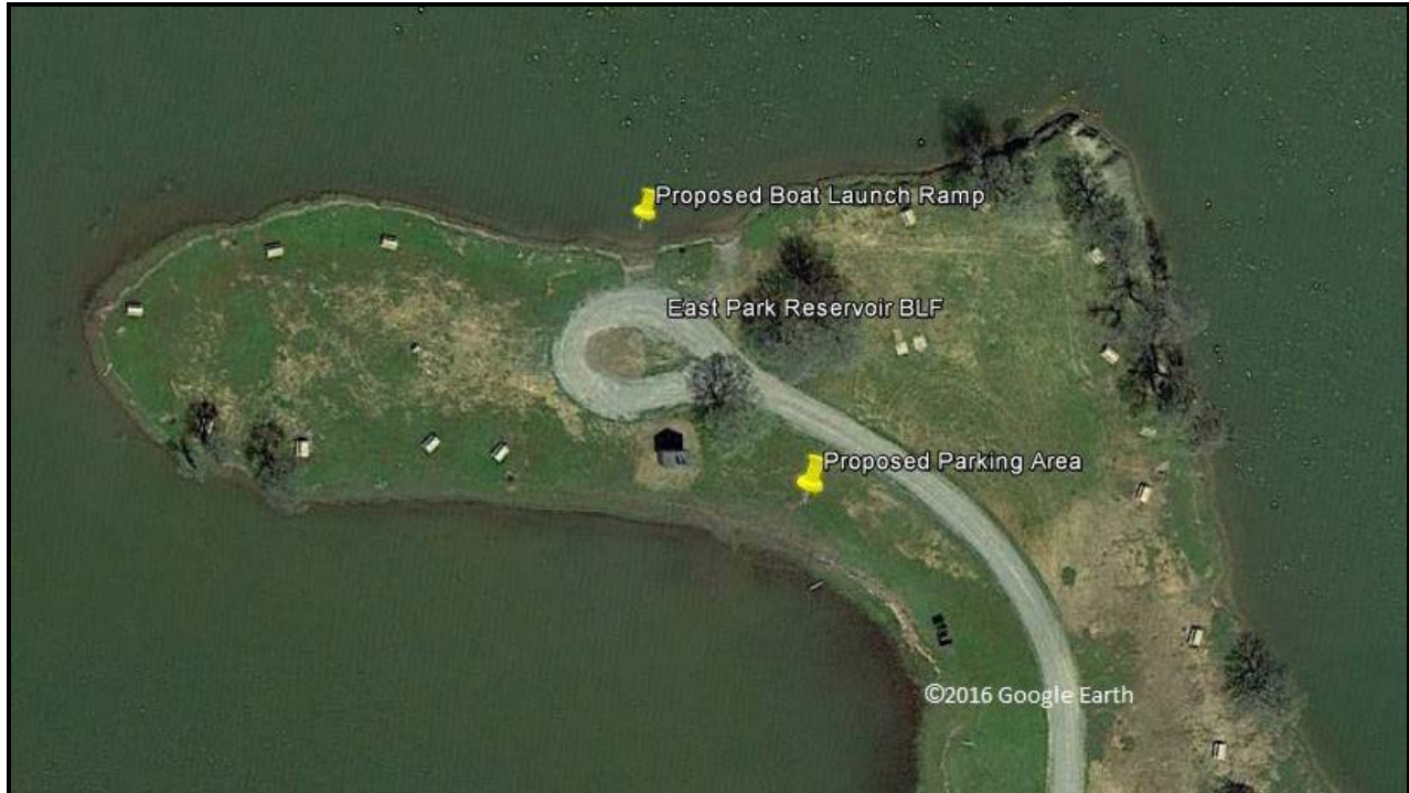
Figure 3. Approximate Locations of Boat Launch Facility Improvements