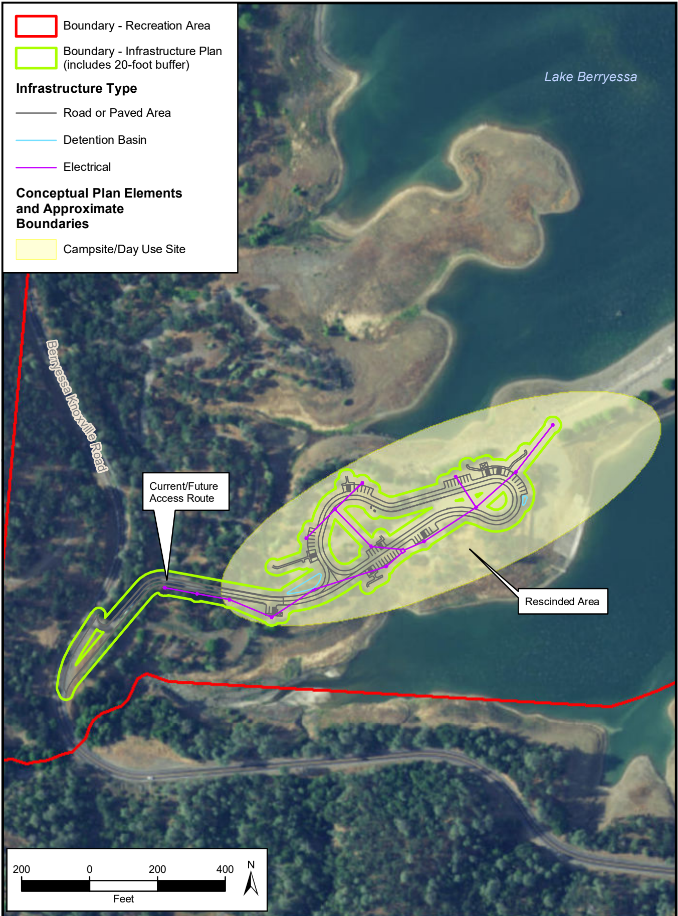
Lake Berryessa Recreation Areas Development

Document Path: G:\Projects\12_10200_007_Lake_Berryessa_Env\CDS\GIS\Working_MXDs\Fig_C-3_BerryessaPt_CI_Plans_NoLogo.mxd