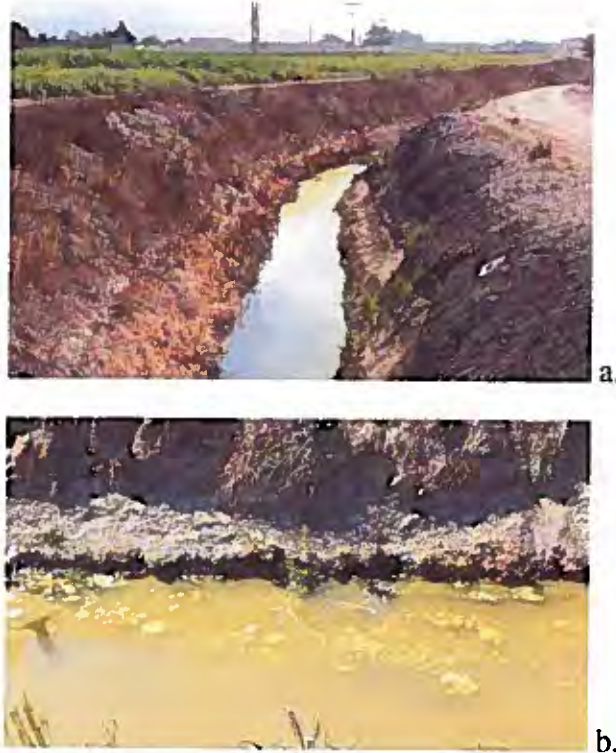
Figure 3. A view of the Reclamation Ditch from approximately the proposed diversion site (a), and a close-up view of typical water quality conditions near the proposed diversion site during the low flow period (b). September 22, 2016.

Downstream of the State Highway 183 crossing, the Reclamation Ditch is joined with the Merritt Lake drainage and becomes Tembladero Slough. The Tembladero Slough channel is lower gradient and more sinuous but is also surrounded by intensive row-crop agriculture. The channel is tidally influenced with perennial streamflow provided by the Reclamation Ditch, surrounding agricultural return flows, and tile drains. Tembladero Slough discharges into the Old Salinas River channel approximately 1.3 miles upstream of the Potrero Road tide gates. The Old Salinas River channel (historic course of the Salinas River) is also a tidally influenced slough that receives flows from the Salinas River lagoon and the Tembladero Slough-Reclamation Ditch drainage, as well as adjacent agricultural return flows. The tidal influence is the result of leakage through the Potrero Road tide gates, which results in both longitudinal and vertical salinity gradients within the Tembladero Slough and the Old Salinas River channel (Casagrande and Watson 2006; Snider et al. 2016).