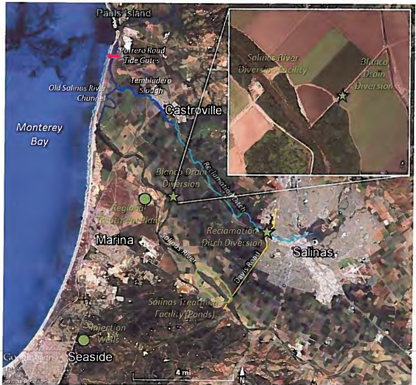
Figure 1. The action area vicinity for the GWR Project including the locations of affected water bodies, existing and proposed infrastructure, and nearby cities. Inset map shows the Blanco Drain diversion facility and its proximity to the Salinas River and the SRDF.

The Blanco Drain receives runoff from approximately 6,400 acres of primarily row crop agricultural lands. The drain enters the Salinas River just upstream of the SRDF, which is located at RM 4.8 near the head of the lagoon. The Blanco Drain is separated from the Salinas River by a flap gate, which prevents Salinas River water from entering the Blanco Drain under high water conditions. The small section of the Blanco Drain affected by the project consists of a highly entrenched and artificial channel with substrate consisting of fine sediments (Figure 2). Streamflow is present throughout the year due to agricultural return flows from tile drains and surface runoff during winter and irrigation events. Average monthly flow rates range from 2.2 to 4.6 cfs, however daily flows rates over 6 cfs have been recorded in recent years. During drought