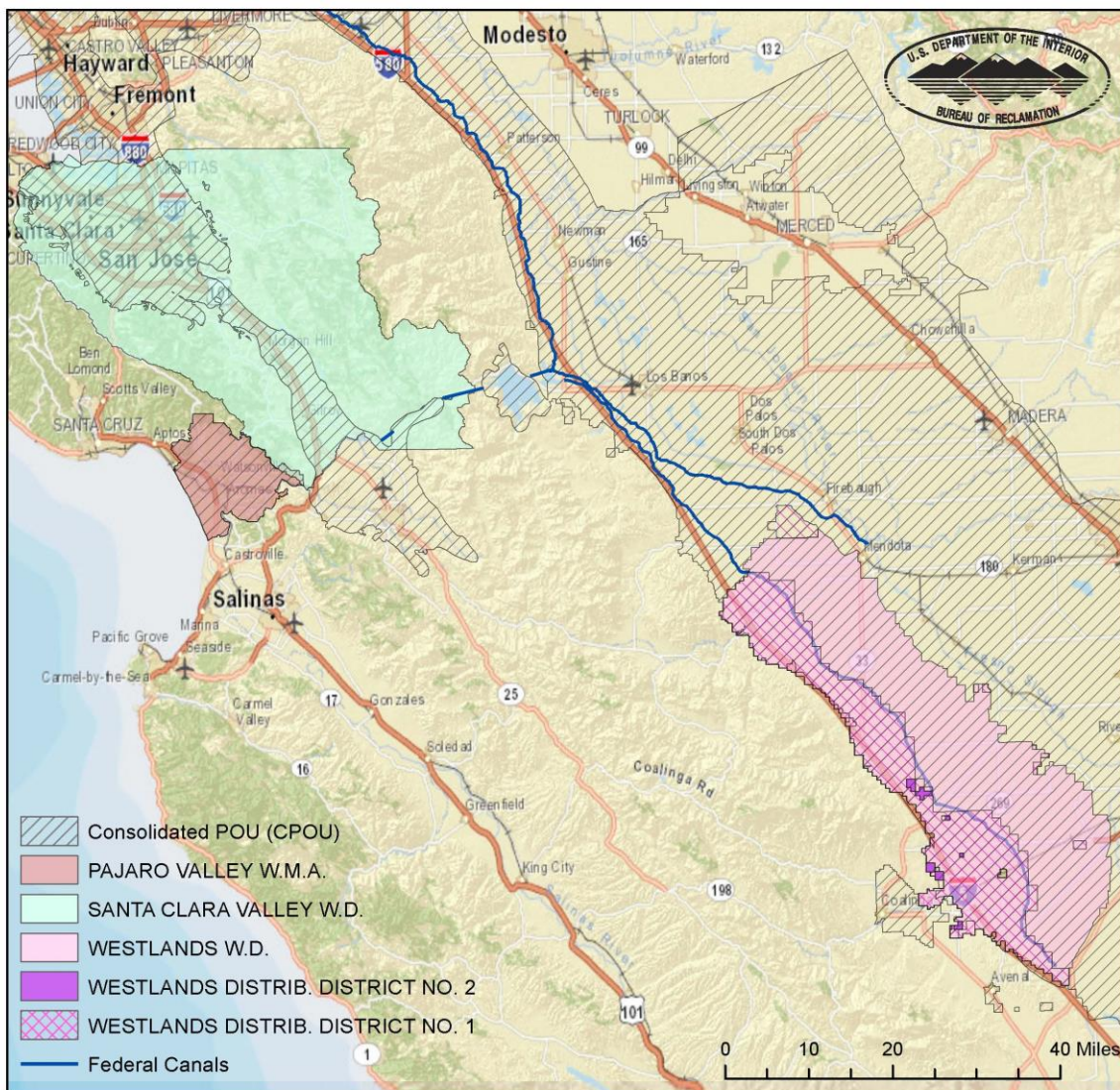
Figure 1 Proposed Action Area

This section describes the service area for the contractors listed in Table 1 which receive CVP water from the Delta via Delta Division, San Felipe Division, and San Luis Unit CVP facilities. The study area, shown in Figure 1, includes portions of Fresno, Kings, and Santa Clara Counties. Maps of individual contractor CVP service areas can be found in Appendix A. As described in Section 1.3, Pajaro Valley does not have the ability to receive CVP water at this time and is not included in this analysis.