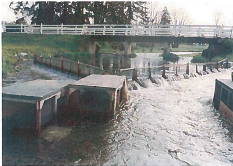
Figure 2. Example Weir (Washington Department of Fish and Wildlife)