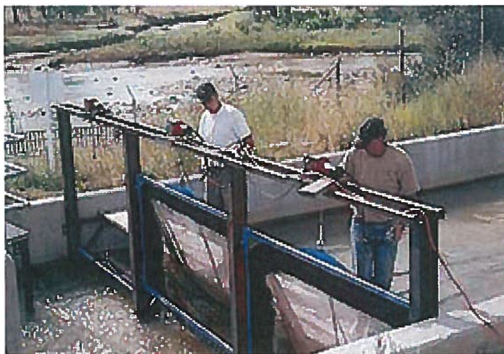
Figure 3. Example Entrainment Netting