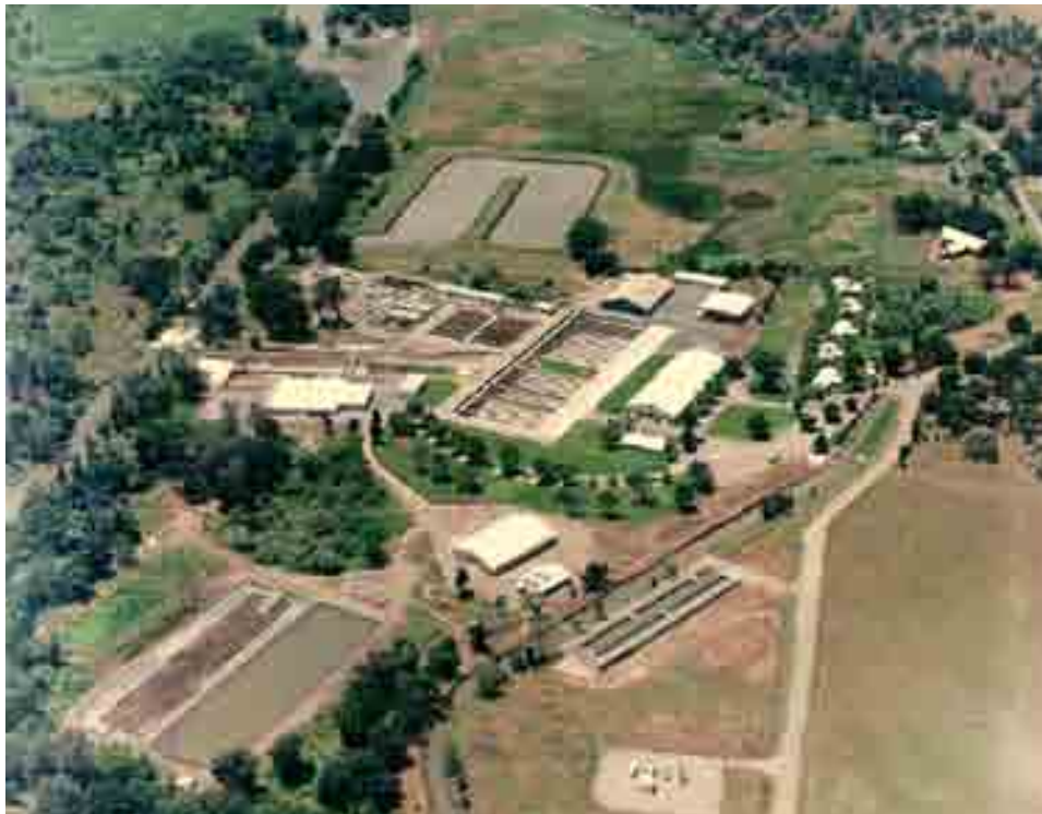
Figure 6-3 Coleman National Fish Hatchery