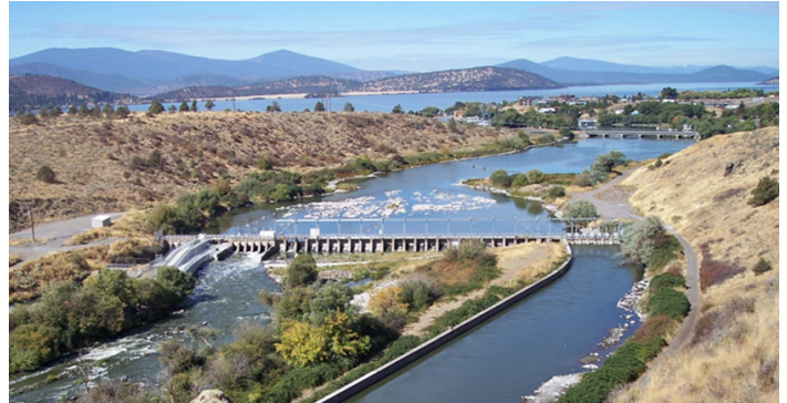
Klamath Project's Link River Dam regulates Oregon's largest body of water—Upper Klamath Lake—and helps store up to 562,000 acre-feet of water used for Klamath Project irrigation, sustains wildlife at refuges, and provides critical habitat for endangered species.