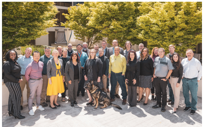
CGB Regional Management Team

The Region employs nearly 1,000 people in a wide-range of positions from engineers to park rangers, to fish biologists to administrative professionals. Project managers take the lead in planning contracts, implementing habitat improvements, and furthering infrastructure projects. Operations and maintenance personnel manage and maintain critical facilities in drought and flood conditions, monitor facilities instrumentation, perform preventive maintenance, and oversee rehabilitation and repair projects. Our professional experts provide the design, engineering, construction, data processing, human resources, procurement, budget, and other services essential to getting the job done.