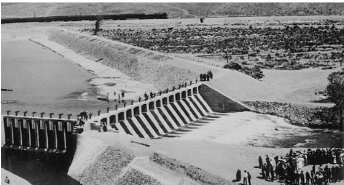
Historical photo of Derby Dam—part of the Newlands Project—and one of Reclamation's oldest projects.

President Roosevelt signed the Reclamation Act (also known as the Newlands Act) into law in 1902, creating the U.S. Reclamation Service, which was renamed the Bureau of Reclamation in 1923.