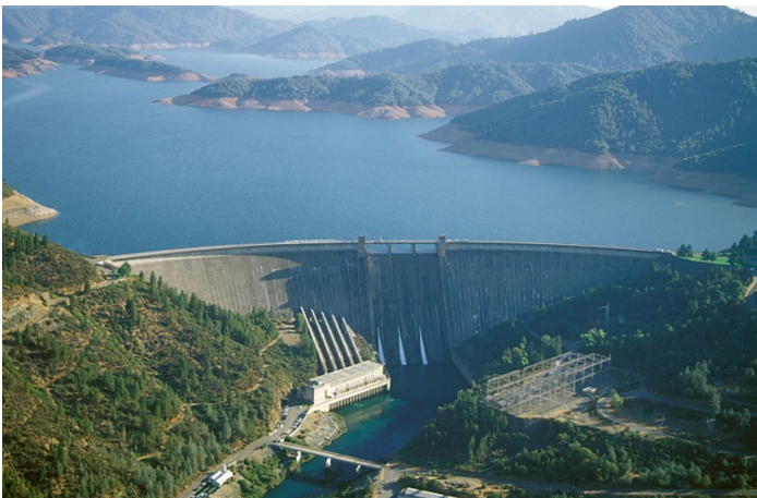
Shasta Dam and Reservoir, with a storage capacity of 4.5 million acre-feet, are cornerstone features of the Central Valley Project.