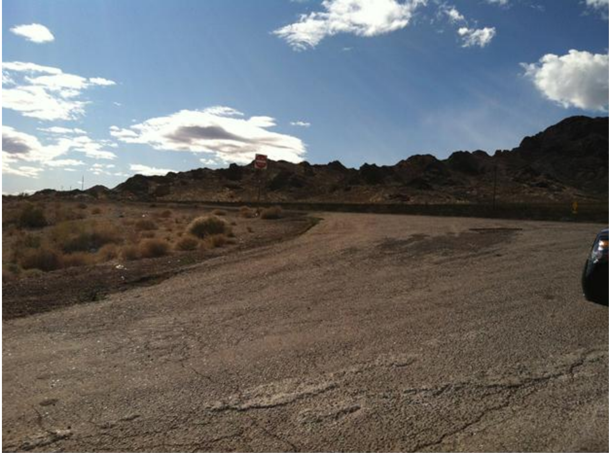
Figure 4: Turnoff looking back toward US 93 northbound lane