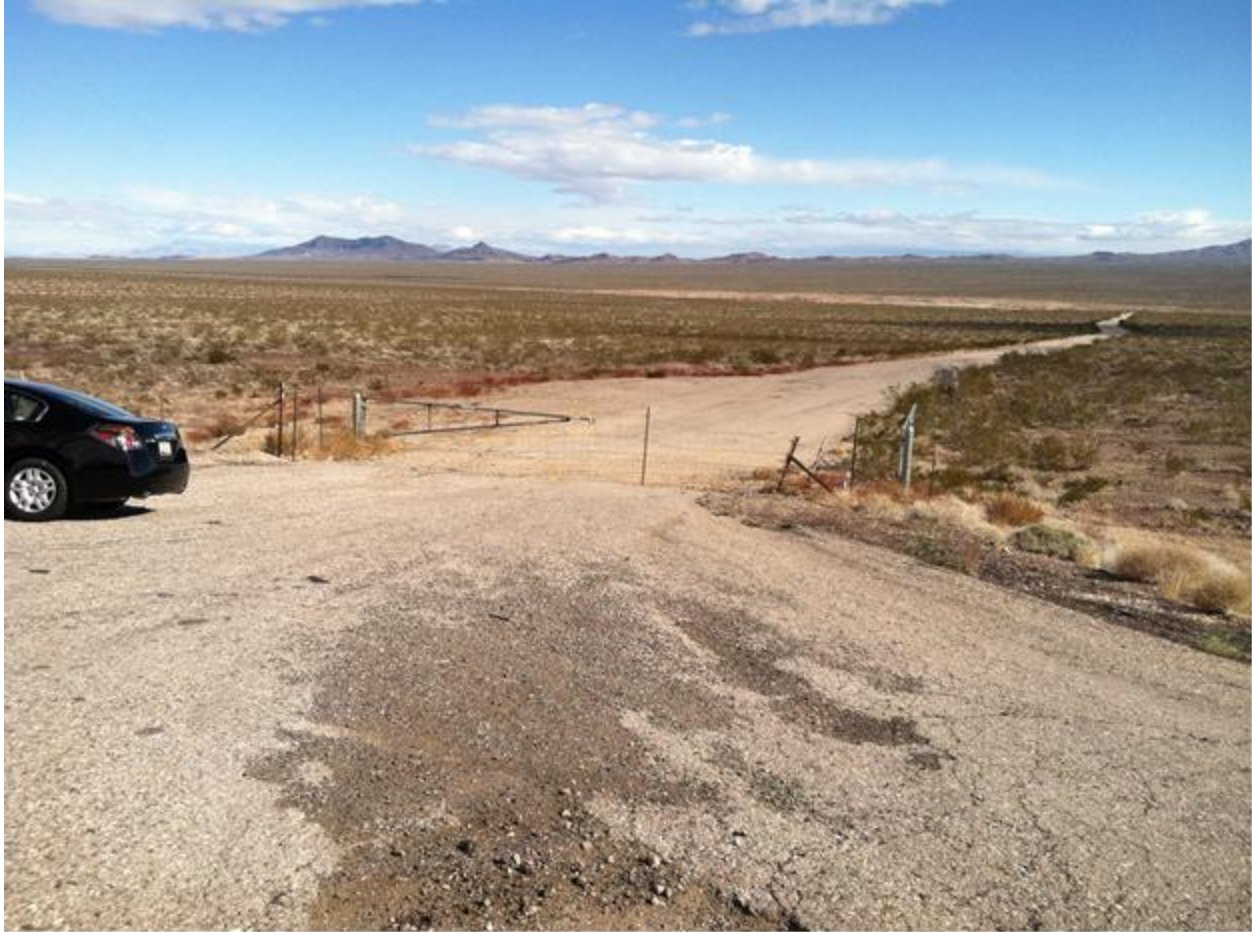
Figure 3: Existing turnoff from northbound lane on US 93 toward existing mine pit and will be extended to Project Site