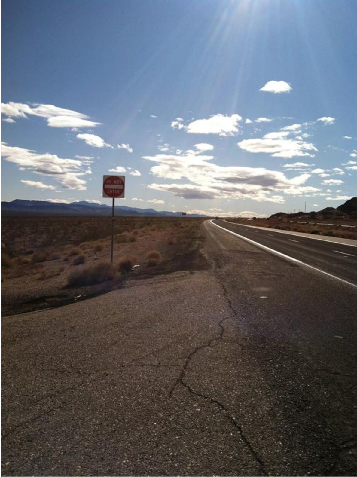
Figure 2: Existing turnoff from northbound lane on US 93 toward existing mine pit