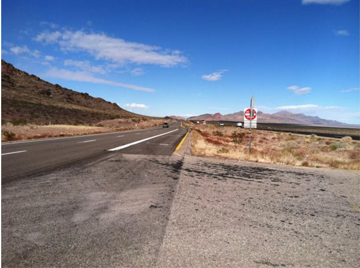
Figure 6: Southbound lane on US 93 with existing turnout to cross median over the northbound lane and onto the mineral pit