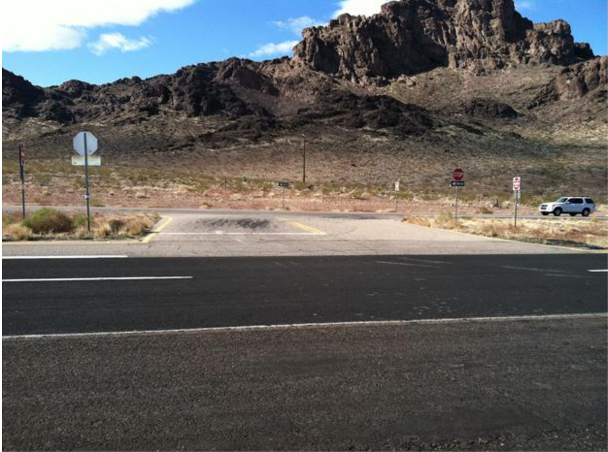
Figure 5: Median crossover from southbound lanes to northbound lanes on US 93